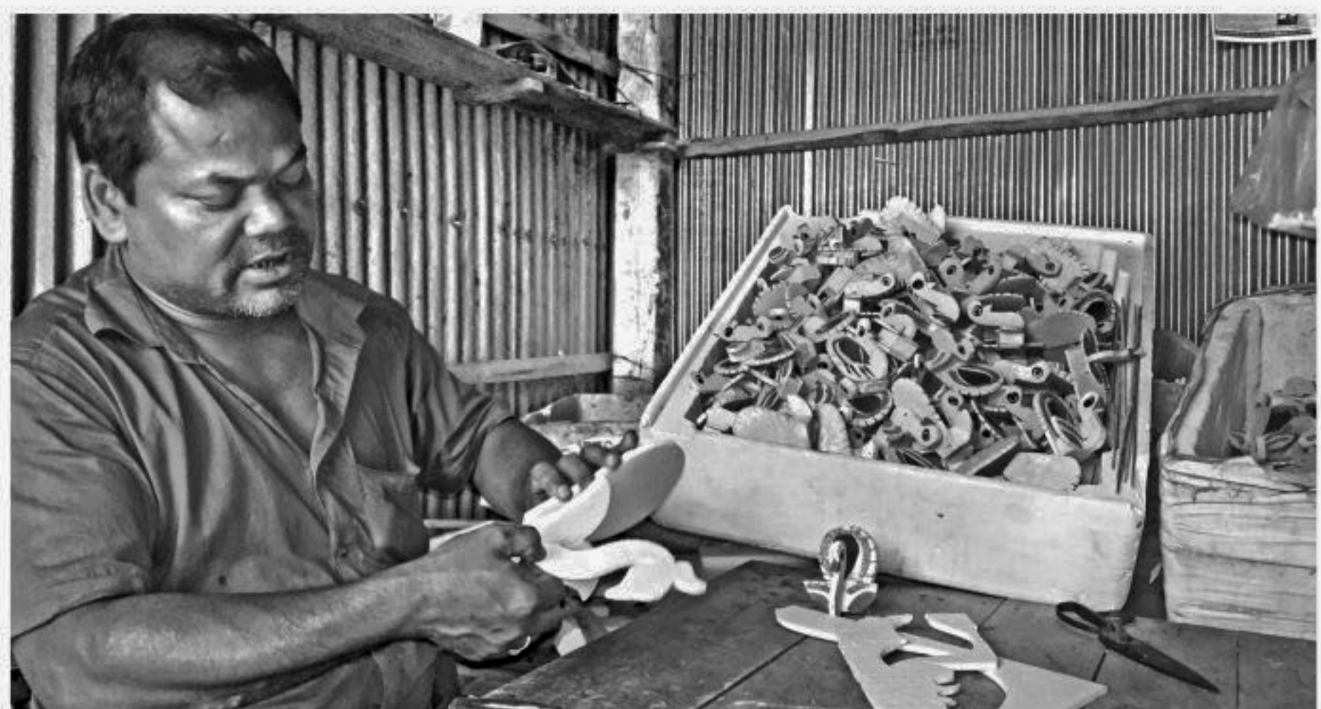
From left, potters in Madaripur and a craftsman in Lalmonirhat making traditional items. The photos were taken recently.