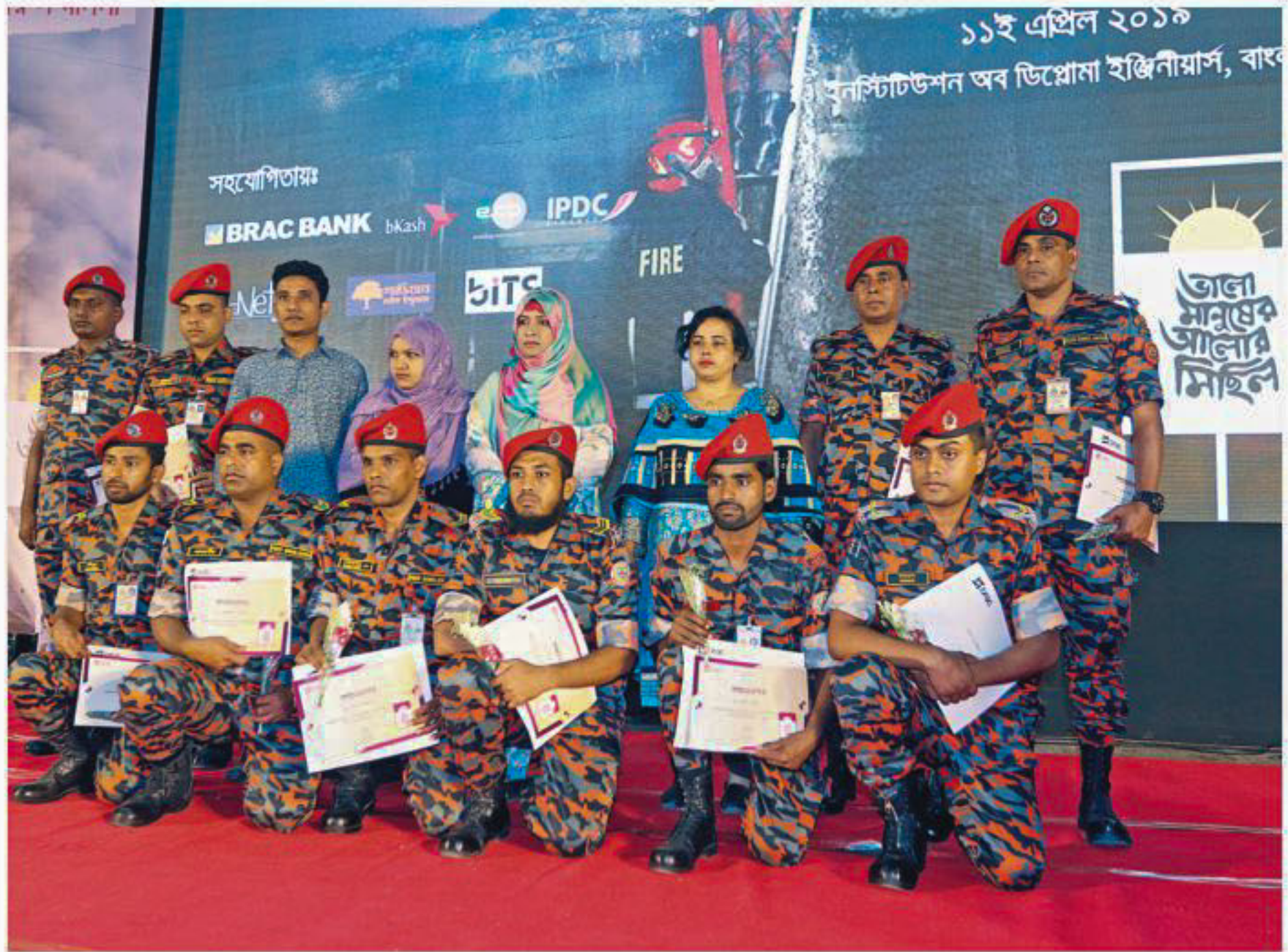
Firefighters with survivors of fire incidents at the event yesterday.