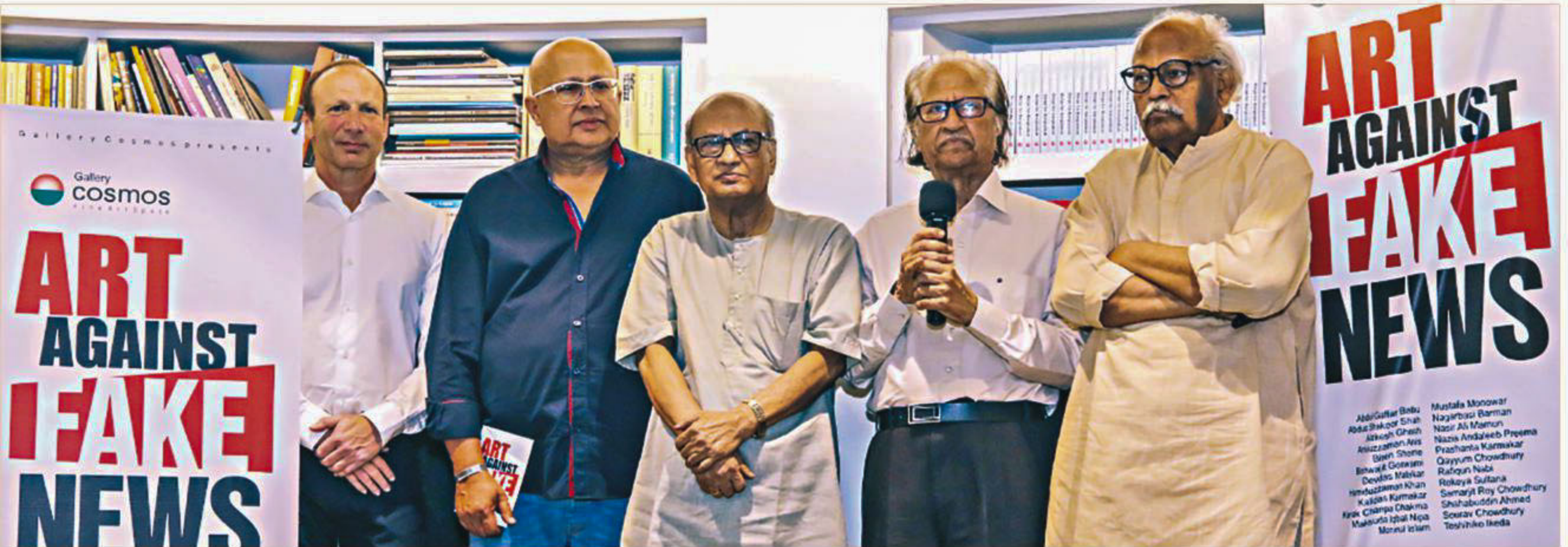
Distinguished guests and artists at the exhibition.