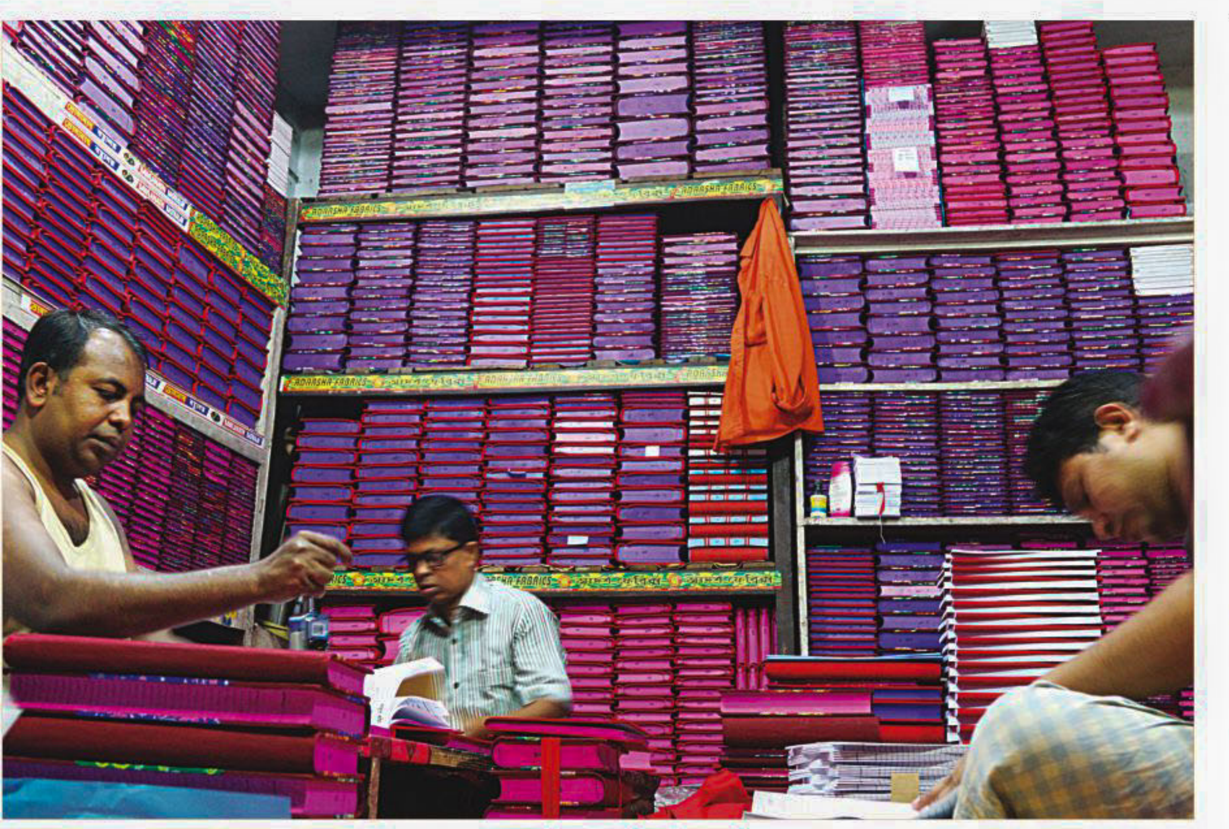
Stacks of new ledgers at a bookbinding shop in Anderkilla of Chattogram city yesterday. Every year on Pahela Baishakh (April 14), traders clear out all dues and arrears and start the new Bangla year with a fresh ledger, also known as halkhata. Despite the advent and popularity of accounting software, demand for new ledgers soar during this time of the year.