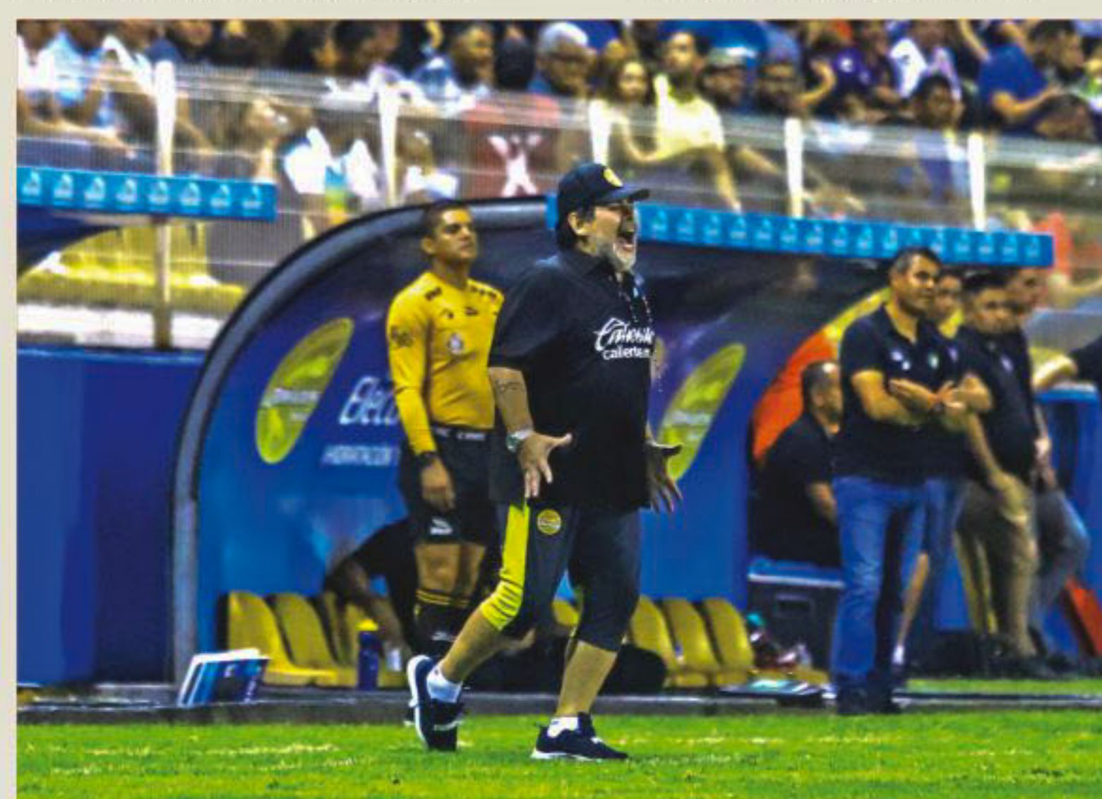
Argentina legend Diego Maradona, coach of Mexican second-division club Dorados, yells at his players during a match against Venados in Culiacan on Friday.

League starts this season while City chase an unprecedented quadruple.