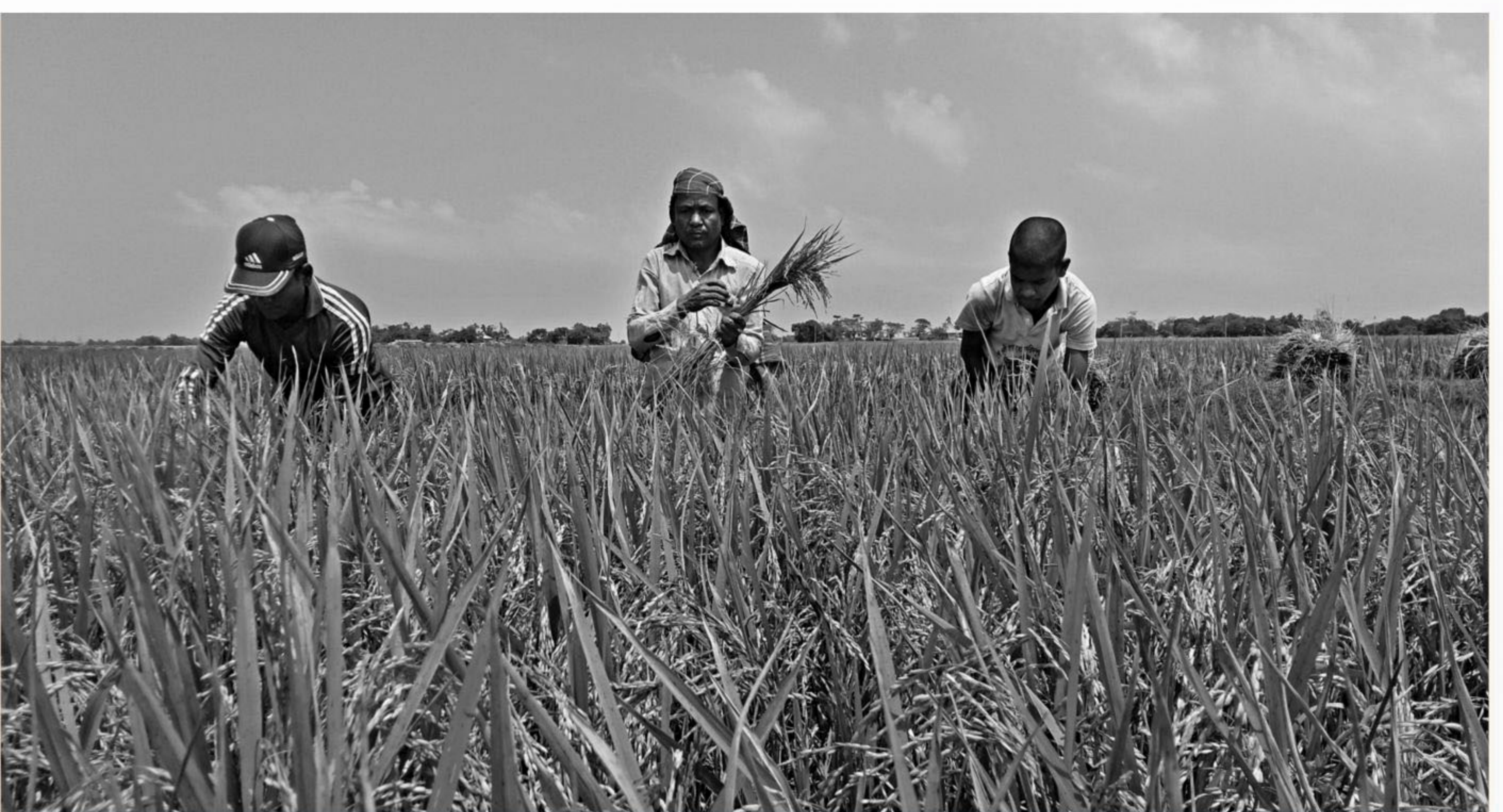
Alarmed by the last couple of days' rain and hailstorm that has already caused damage to Boro paddy in different areas, farmers reap the crop, around two weeks before the stipulated period, at a field of Boromchal area of Hakaluki Haor in Moulvibazar's Kulaura upazila. The photo taken yesterday portrays a typical picture in the vast haor area where farmers faced huge losses of crops due to recurrent floods last year.