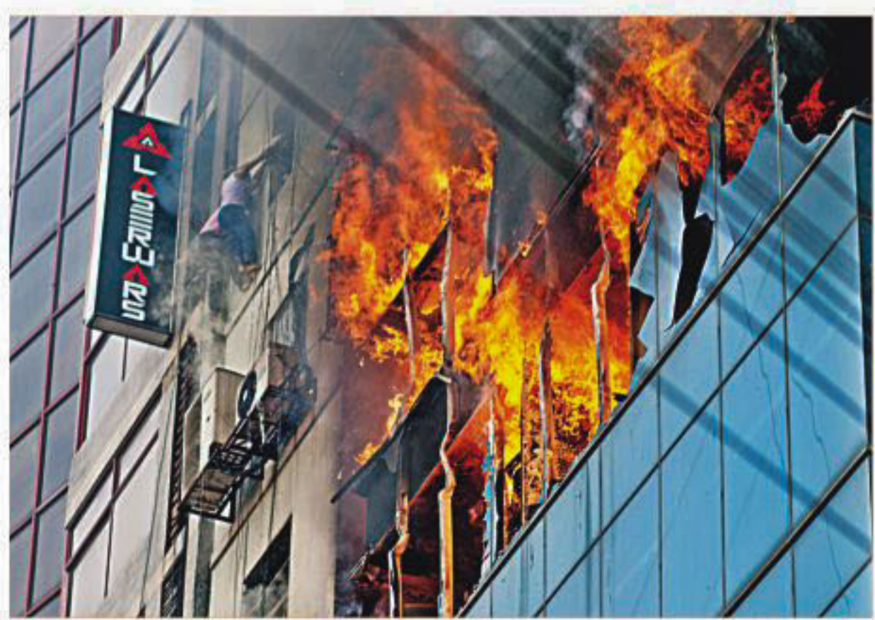
The deadly fire at FR tower killed 26 people.