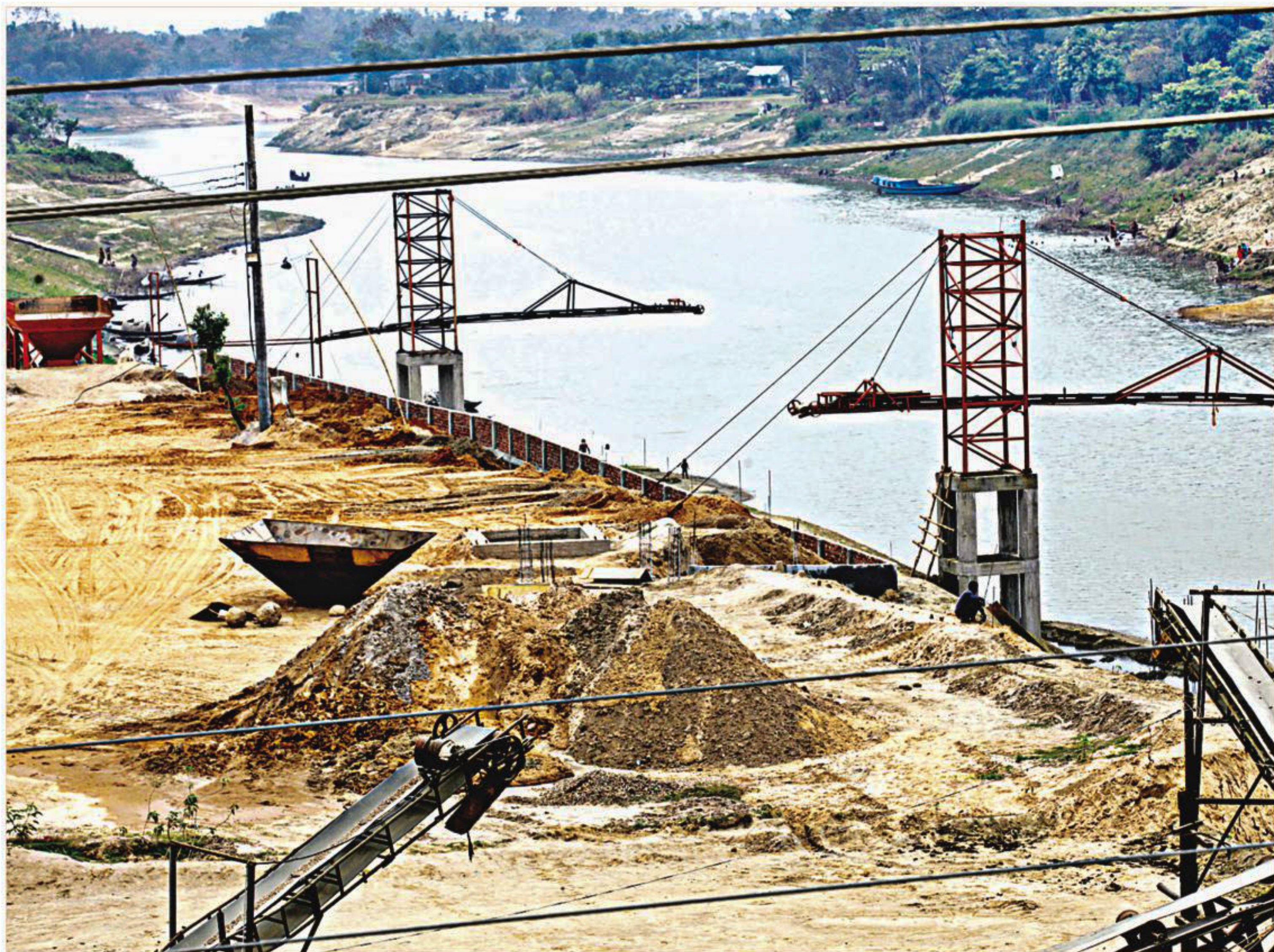
A wall has been built on the bank of the Chengerkhal river in Sylhet's Gowainghat to make an enclosure for stone crushing and a terminal for loading ships. Influential traders have engaged in grabbing the river bank in Shalutikor area, raising questions from locals about the role of the authorities. The photo was taken recently.