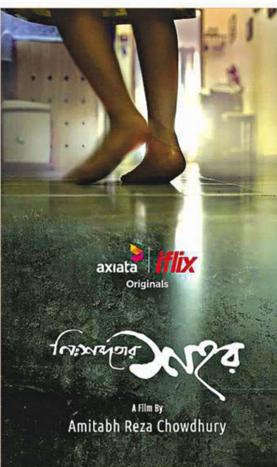
The poster of the film.

The film explores the inner world of the young girl whose fate compelled her to become a housemaid in the city.