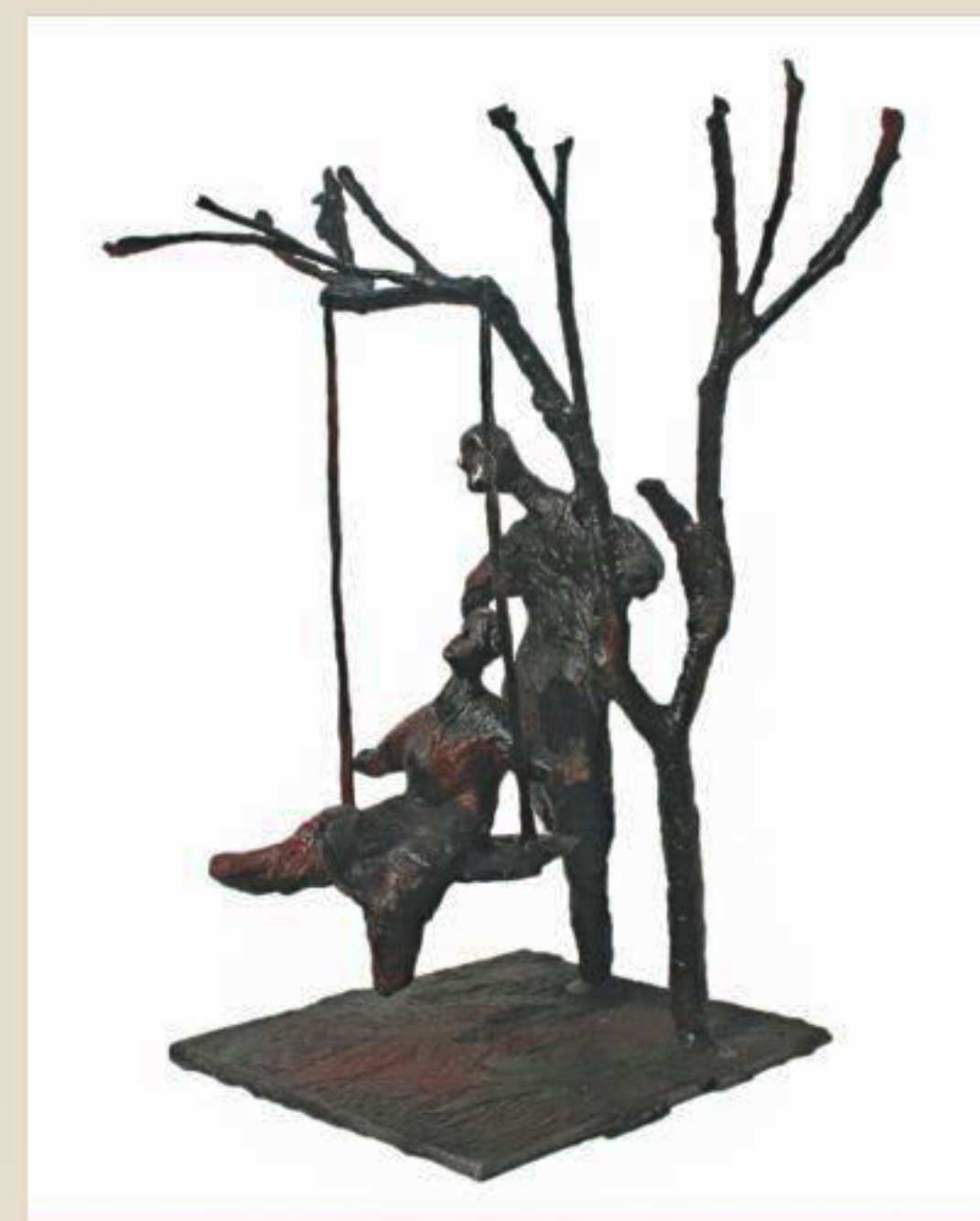
One of Milky's sculptures from the exhibition.