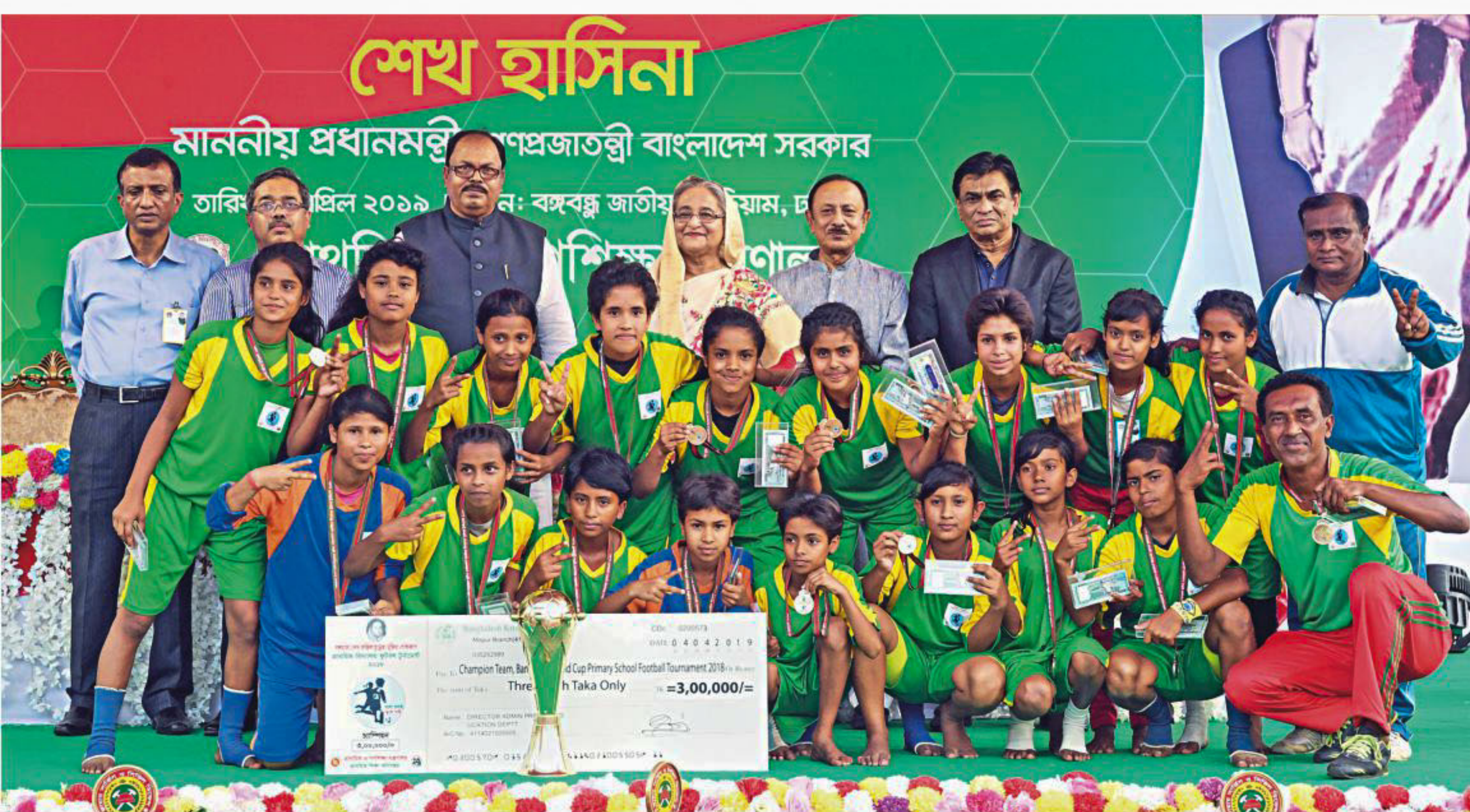
Sport-loving Prime Minister Sheikh Hasina witnessed Panchrukhi Primary School lift the title of the Bangamata Gold Cup with a 1-0 win over Kalsindhur Govt. Primary School and handed out prizes among the winners at the Bangabandhu National Stadium yesterday.

Haripur is the third team from Jaintiapur Upazila of Sylhet to become champions following Nischintapur Non-Government Primary School and Korgram Govt. Primary School, who won the tournament in the first and sixth editions respectively. Cox's Bazar's Pakua Upazila is another place from where three separate schools have been crowned champions in the 2015, 2016 and 2017 editions.