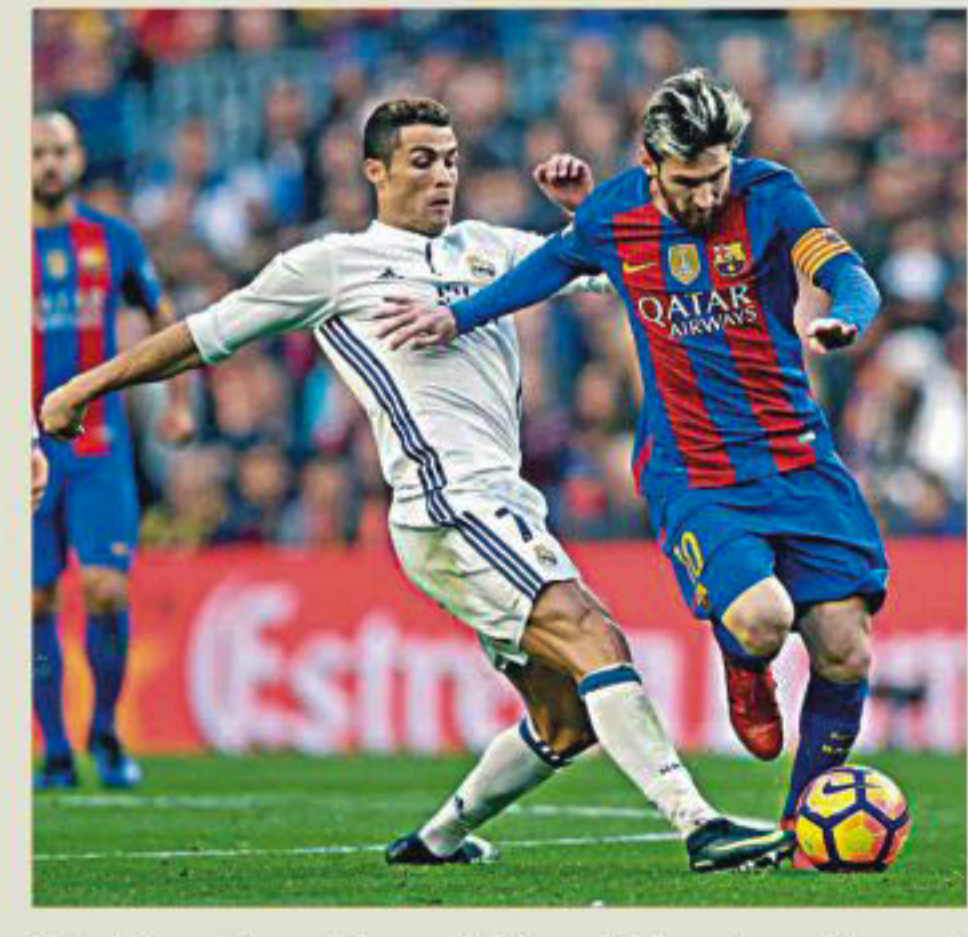
Cristiano Ronaldo and Lionel Messi continued their decade-long dominance in the UCL. Their egregious talent and ravenous hunger once again lit up football.

There was a signature to these games. From Atletico, PSG and Real through to Barca last season -- some of the biggest names in the competition were ceding control of tight matches. It was once again Cruyff's principles towering over the modern game. The great man, whose Ajax and Barcelona sides -- where he both thrived as player and coach, always, in layman's term, talked about suffocating the opponent by 'controlling the ball'. What he and his mentor Rinus Michels however did -- the key facet of the modern game -- was to reimagine football as a highly skilled spatial contest.