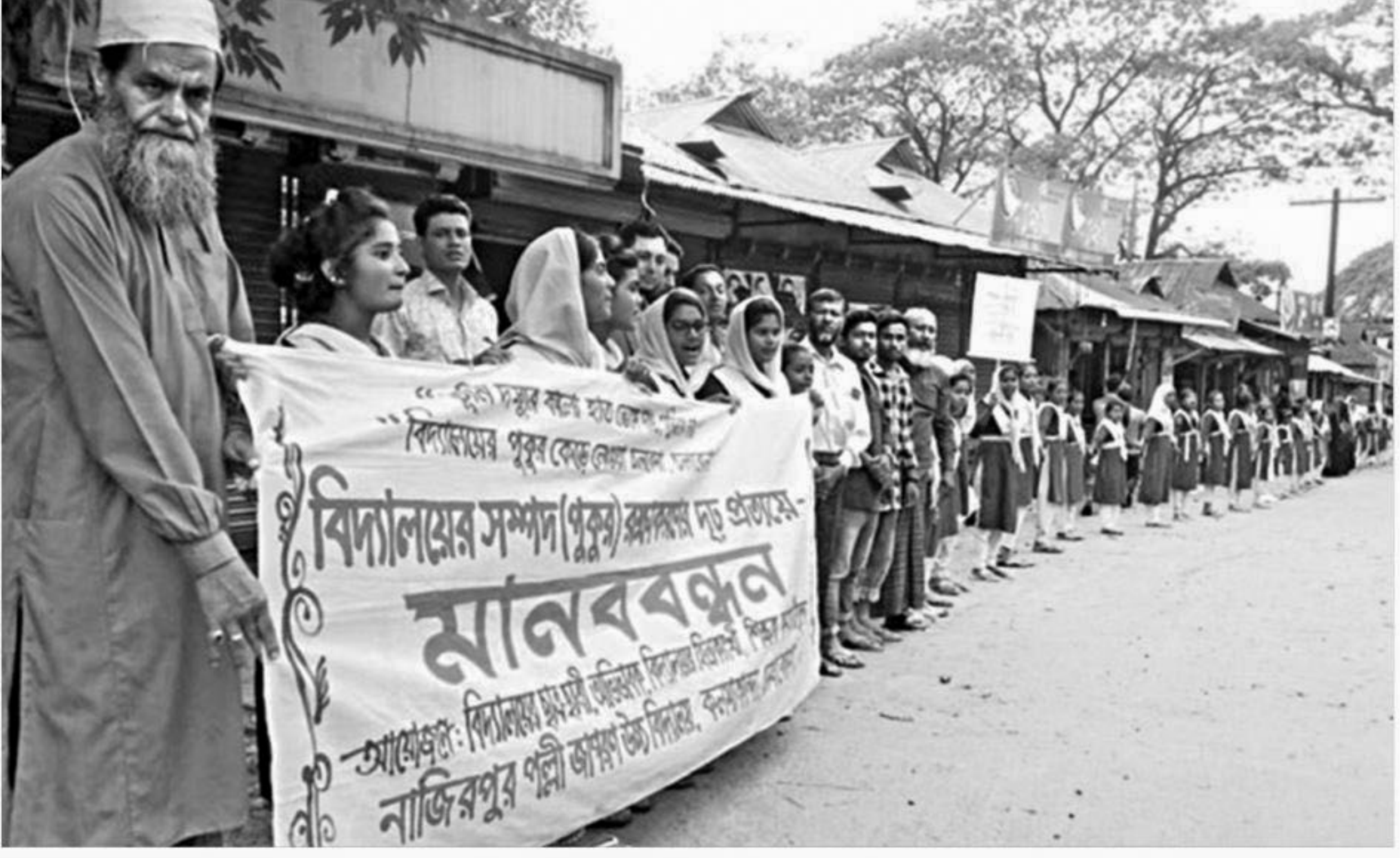
Students and teachers of Nazirpur Palli Jagoron High School form a human chain in Netrakona yesterday demanding steps to save a pond belonging to the school from attempted grabbing by a local.