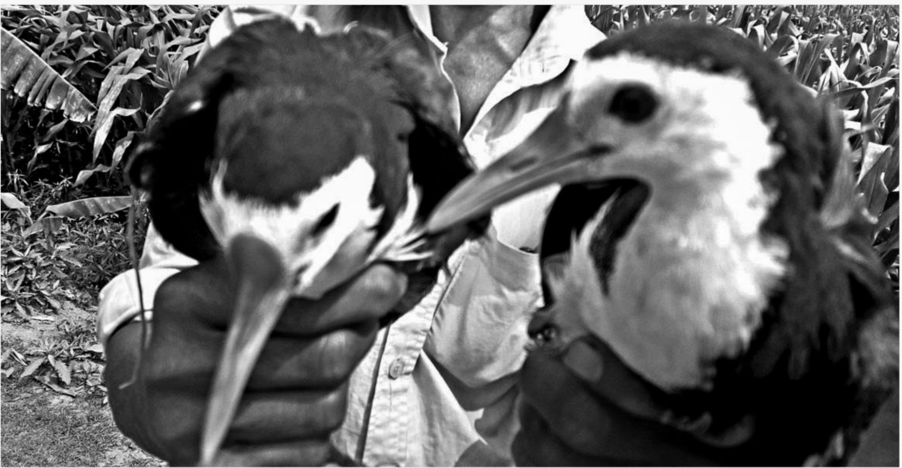
A bird poacher holds two white-breasted waterhens that he caught from a nearby maize field at Khochabari village in Lalmonirhat Sadar upazila.