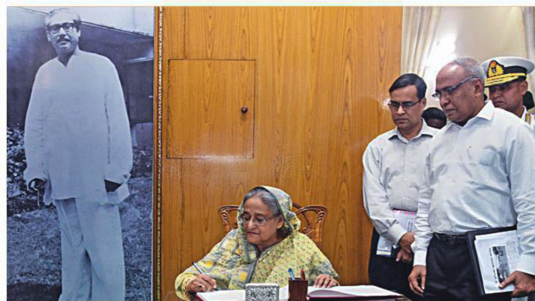
Prime Minister Sheikh Hasina signs the visitors' book at Bangabandhu Memorial Museum set up inside the defence ministry at Sher-e-Bangla Nagar yesterday. This used to be Bangabandhu's office when he was the prime minister and president of the country.