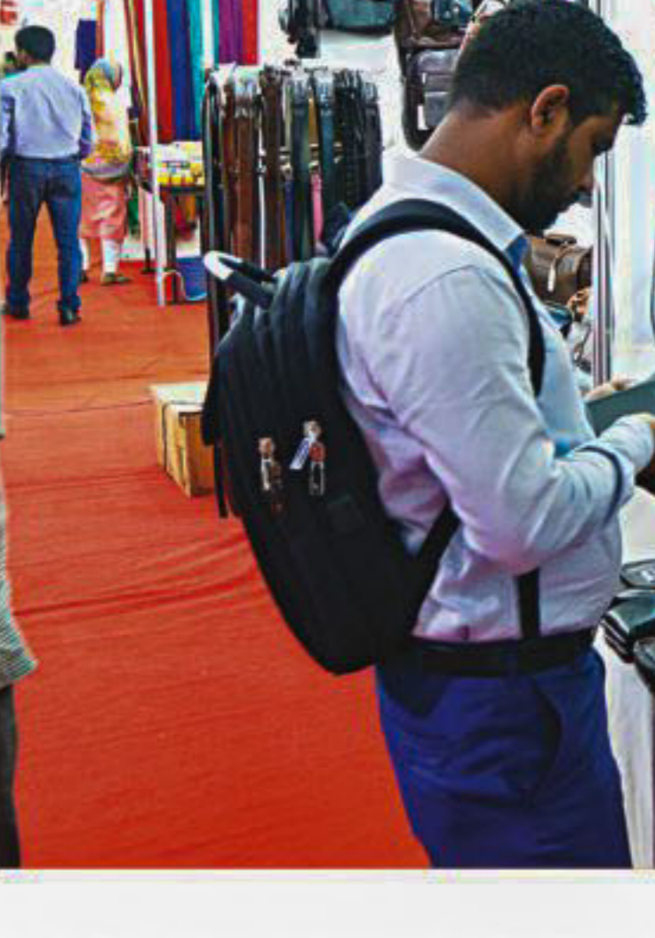
A visitor takes a look at a leather bag at the National Industrial Fair at the Bangabandhu International Conference Center in Dhaka yesterday.

In a presentation, Prof Eusuf said the leather sector had the advantages to leverage a secure supply of raw hides and skins