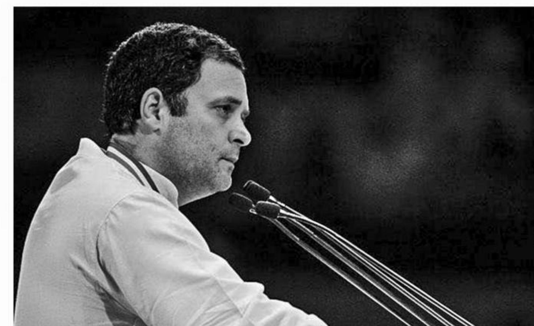
President of the Indian National Congress Party Rahul Gandhi addresses the 48th Congress plenary session in New Delhi on March 17, 2018.

Should Rahul Gandhi be more concerned about opposition unity or about strengthening his own party? It should not be forgotten that all key regional parties across India have either broken away from Congress or grown at the expense of Congress. Rahul Gandhi has signalled his intent to emerge from the shadows of his mother who was more into coalition-building. Wayanad could be the new way forward for the Congress Party and Rahul Gandhi's southern pitch could be the new tune for the party.