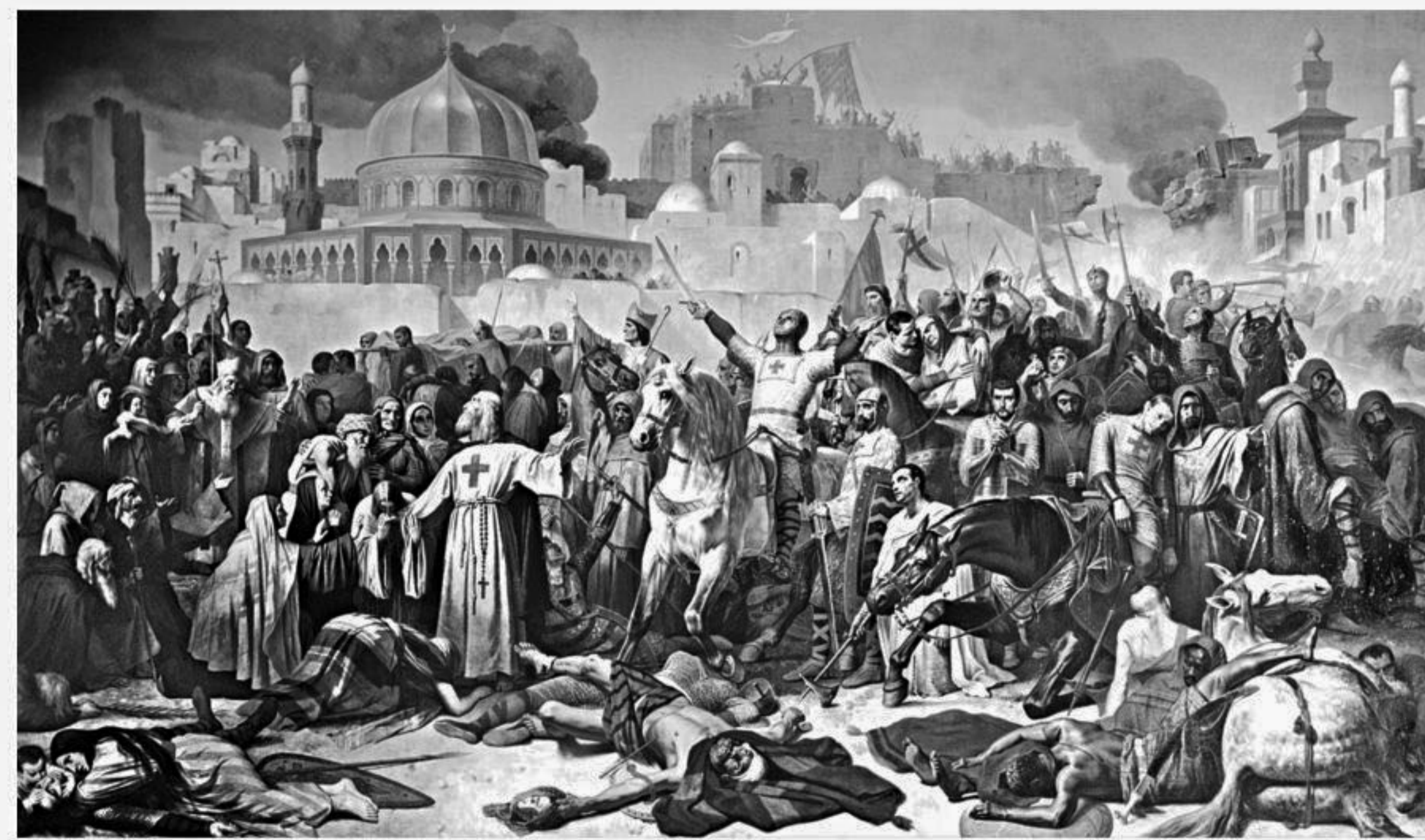
"Taking of Jerusalem by the Crusaders, July 15, 1099" (oil on canvas) by Émile Signol.

The means utilised in this project were brutal, and viciously inflicted. When Jerusalem was captured by the Crusaders in 1099, it was laid waste in an orgy of slaughter and decimation directed at Jews and Muslims. More than 1.7 million people (including Crusaders) perished in this and a subsequent set of sporadic and relentless conflicts that engulfed the