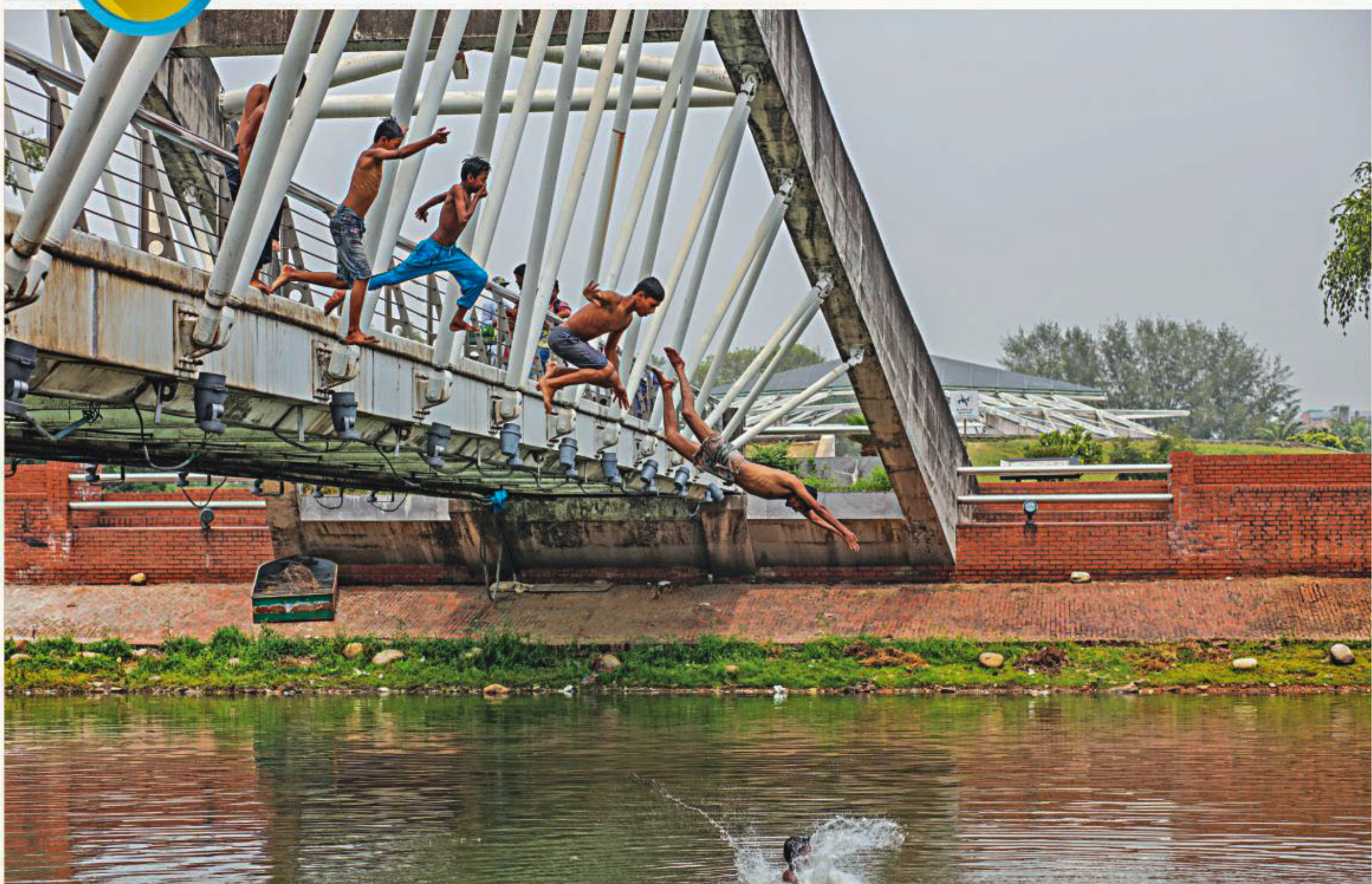
Children in various stages of diving. Although swimming, fishing, and washing clothes in Crescent Lake are prohibited, the rules didn't seem to hamper their playtime. The photo was taken near the parliament yesterday.