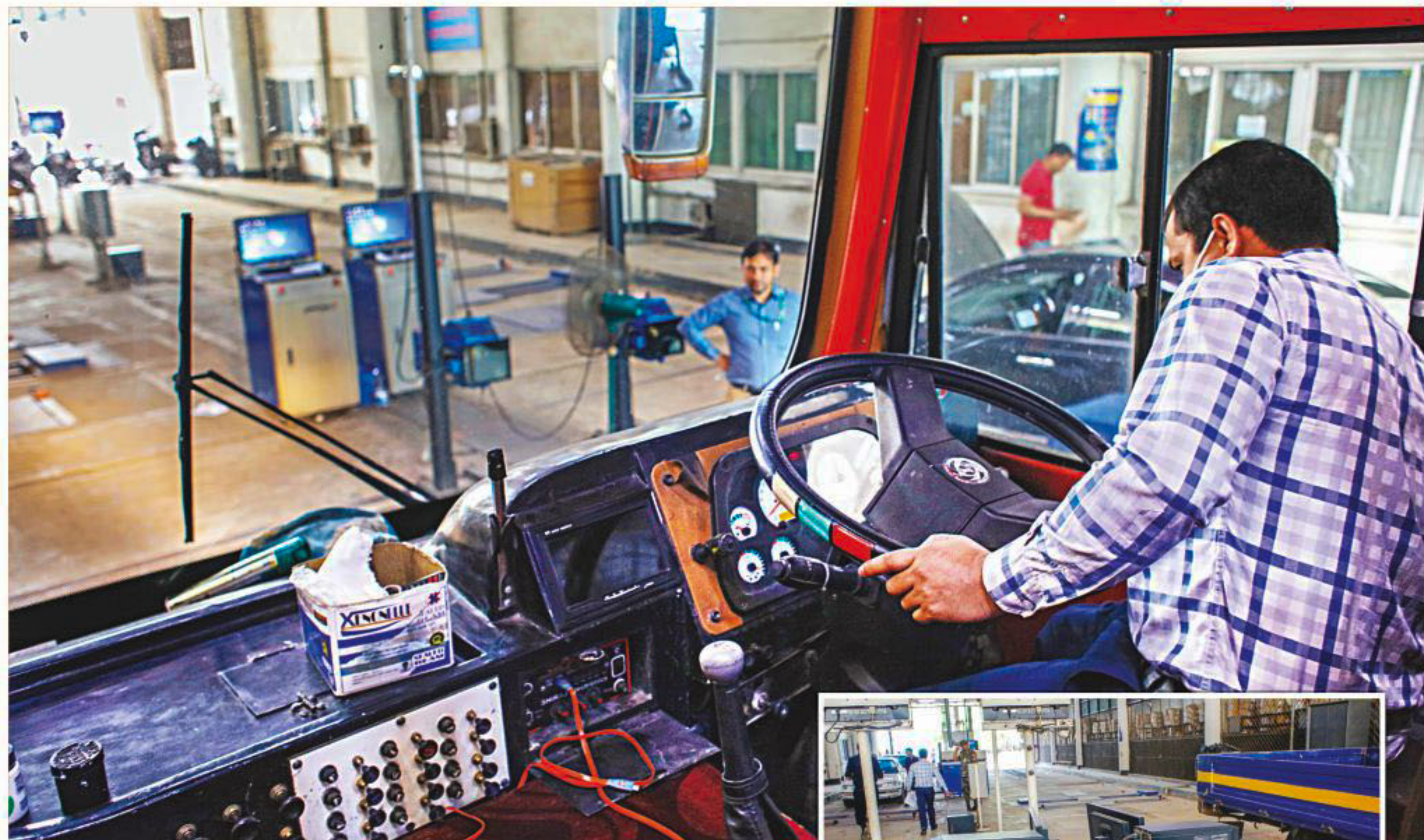
An official checks the instrument panel and controls of a bus at the BRTA's Mirpur office as the government's only automatic vehicle inspection centre, inset , has been out of order for nearly three months. Such manual inspections leave room for corruption and compromise safety. The pictures were taken on Monday.