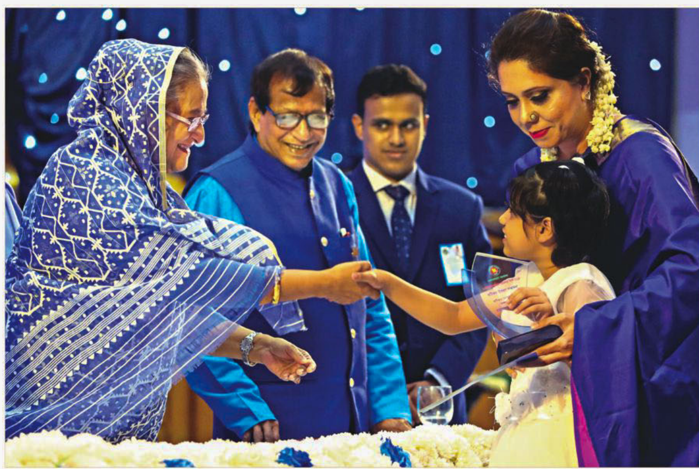
Prime Minister Sheikh Hasina awards a child at a programme marking World Autism Awareness Day yesterday.