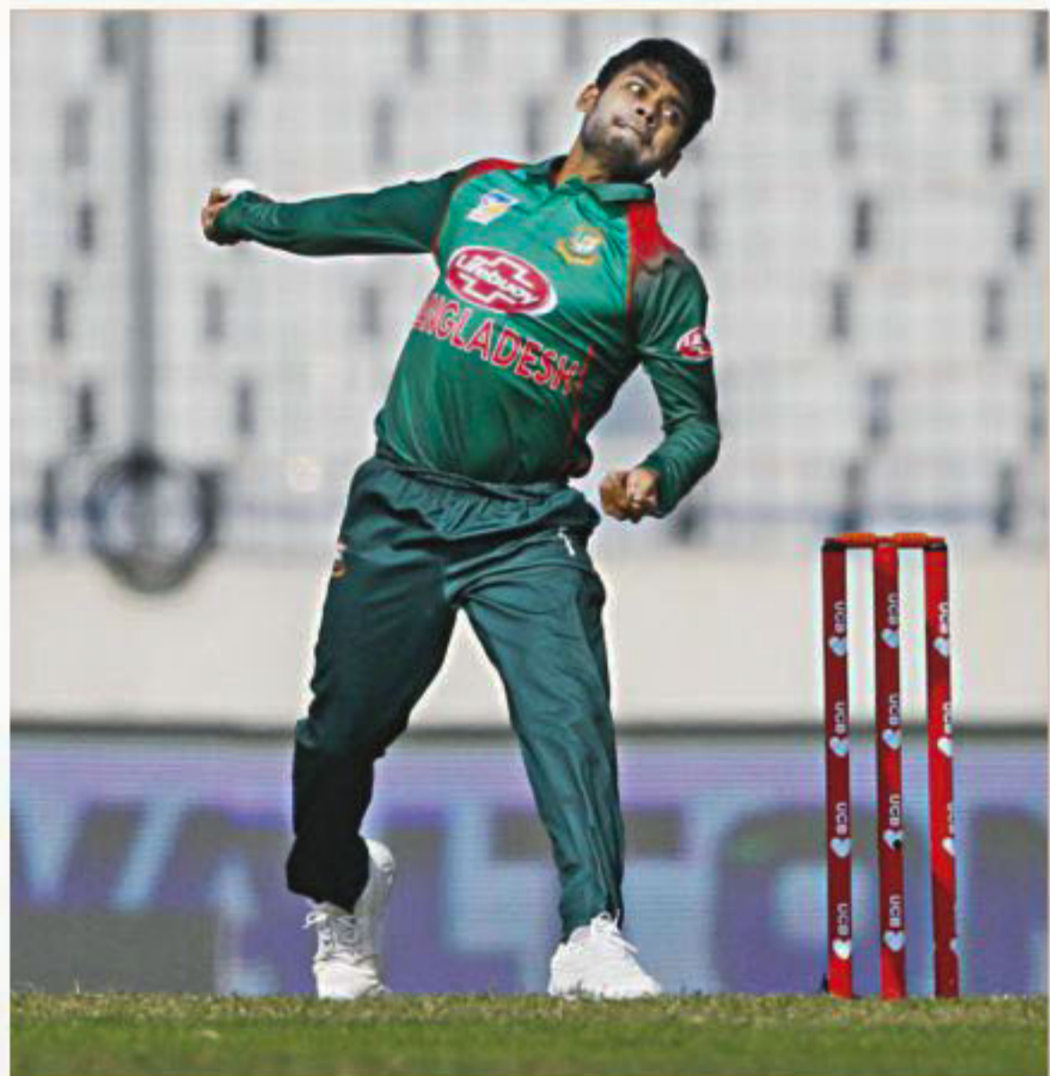
Mehedi Hasan Miraz has become somewhat of a regular in Bangladesh's one-day team, however, the young all-rounder may miss out on a spot come the World Cup.

The cricketer from Khulna has had the experience of playing in England during the Champions Trophy in