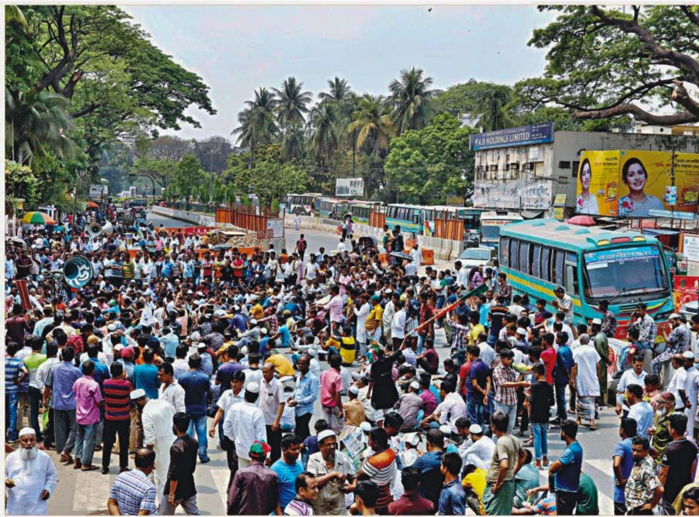
Clockwise from left, blocking a large part of Topkhana Road near Jatiya Press Club yesterday, hawkers protest the Dhaka South City Corporation's drive to keep streets and footpaths free from vendors. The blockade started around 10:30am and continued for almost four hours, resulting in long tailbacks in the area. An exhausted commuter dozes off in a bus.