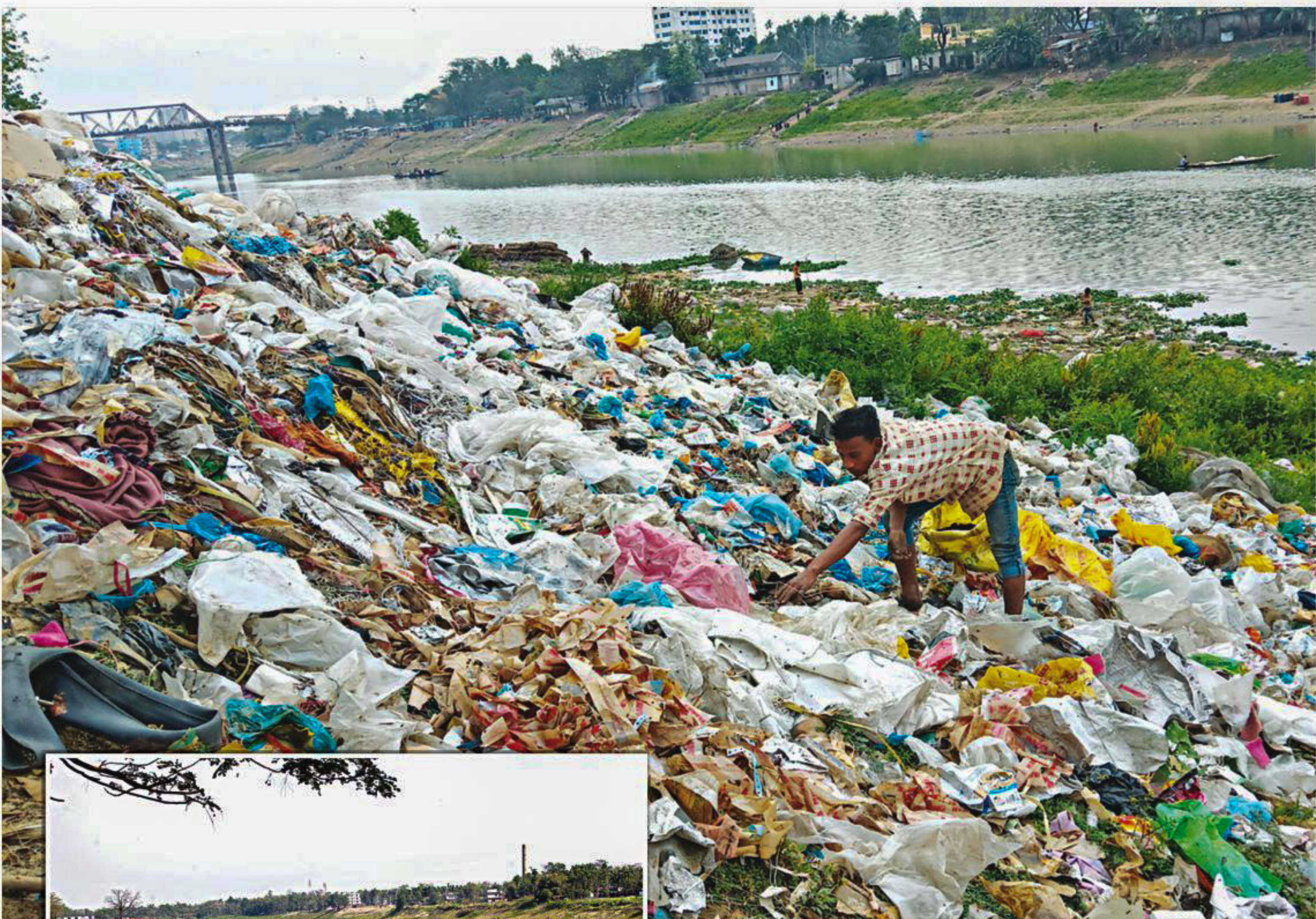
A ragpicker rummages through a heap of litter on the bank of the Surma river in Sylhet. Inset, pollution and littering have resulted in the river losing its navigability. The pictures were taken recently in the city's Muktir Chawk area.