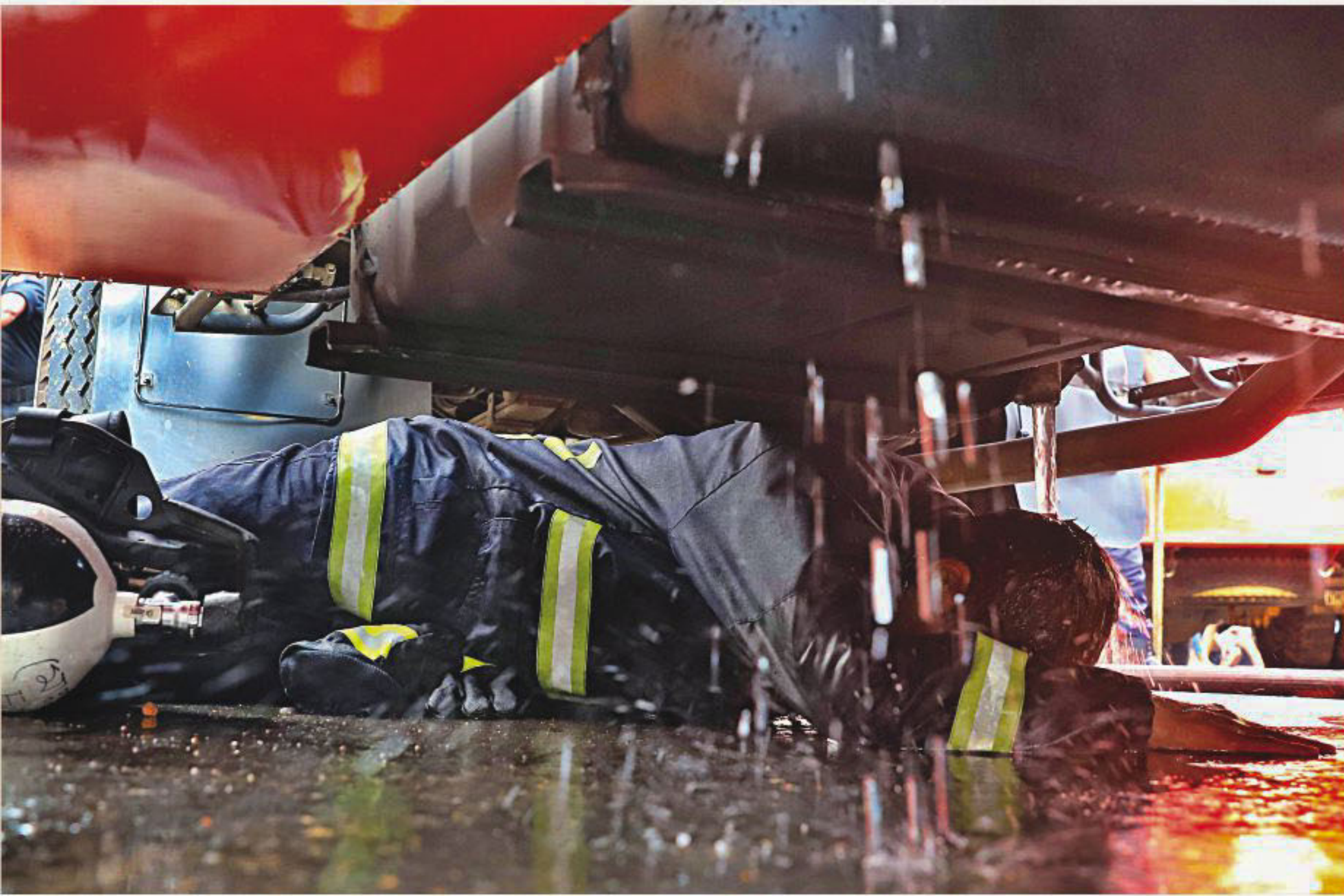
An exhausted firefighter has his head soaked with water from a hose underneath a fire truck in front of the Gulshan market where a fire broke out yesterday morning.