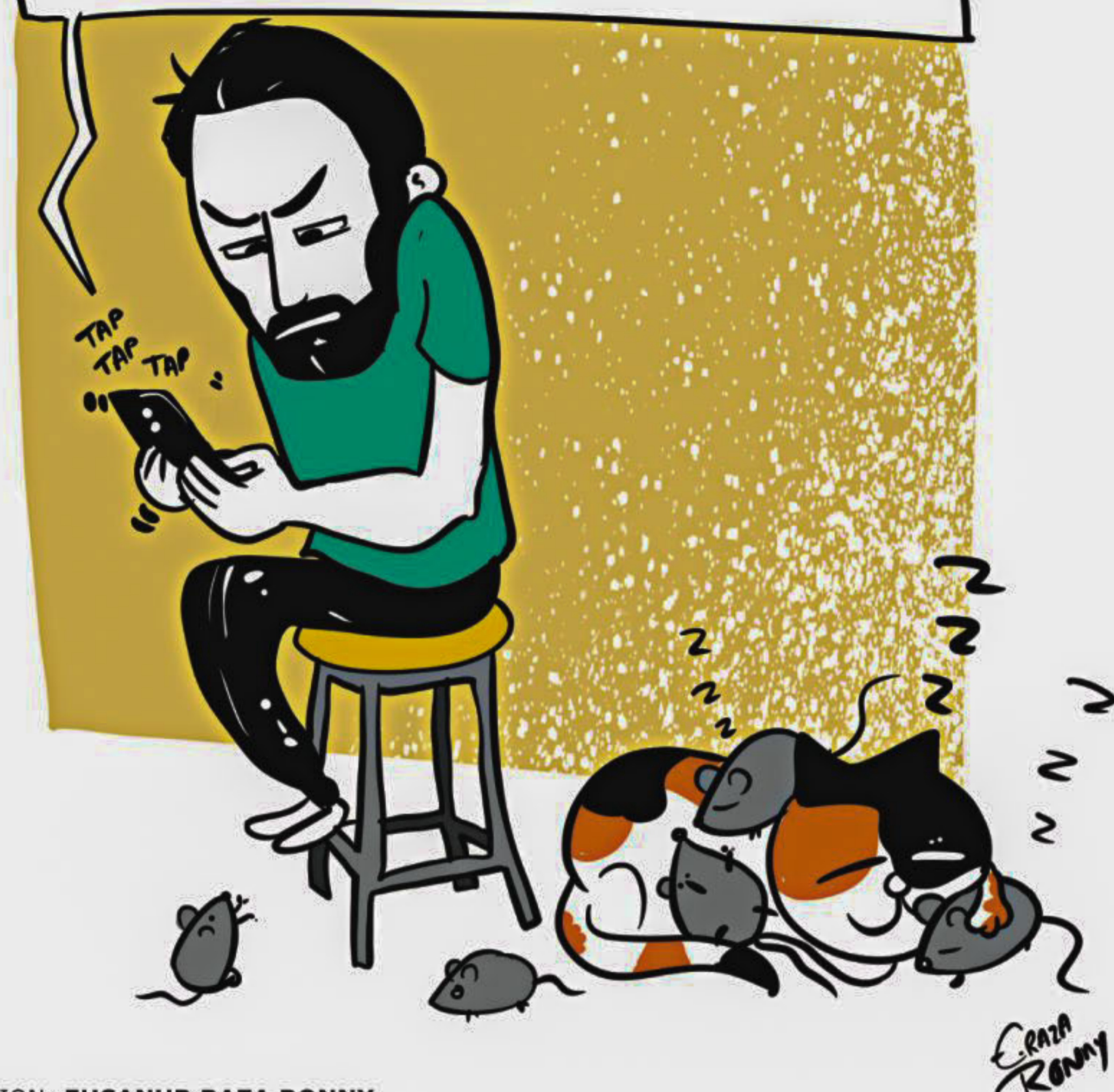
ILLUSTRATION: EHSANUR RAZA RONNY

Cat for adoption. Potty trained. Friendly. Can catch mice.