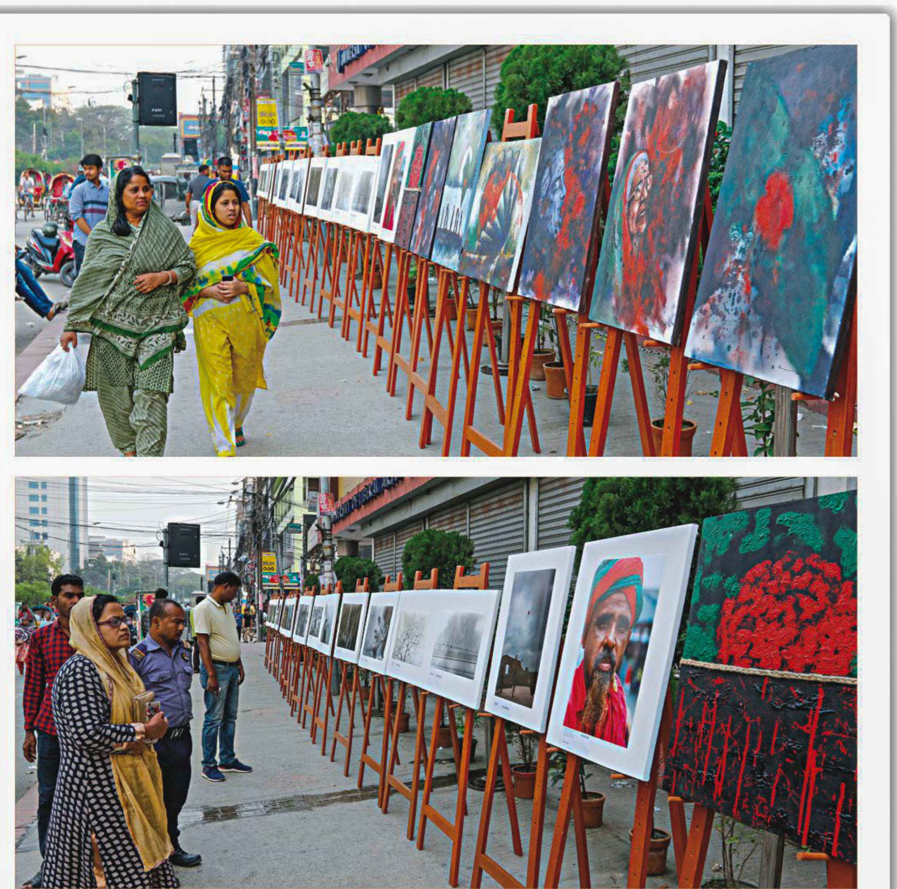
Terracotta Creatives organised a public art exhibition titled, '8th Rongottor Art Exhibition' in Dhanmondi yesterday, marking our Independence Day. The exhibition consisted of photographs and paintings by various photographers and artists across the country. Rongottor is an initiative that aims to decentralise art from Dhaka as well as to take art events to the mass people in Bangladesh.