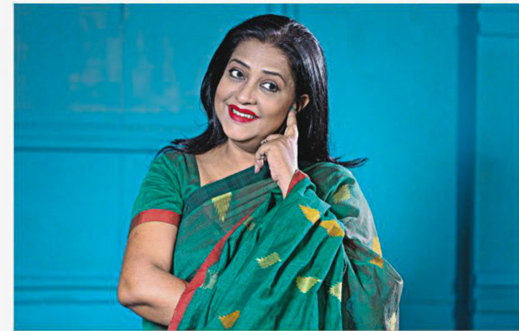
Suborna Mustafa