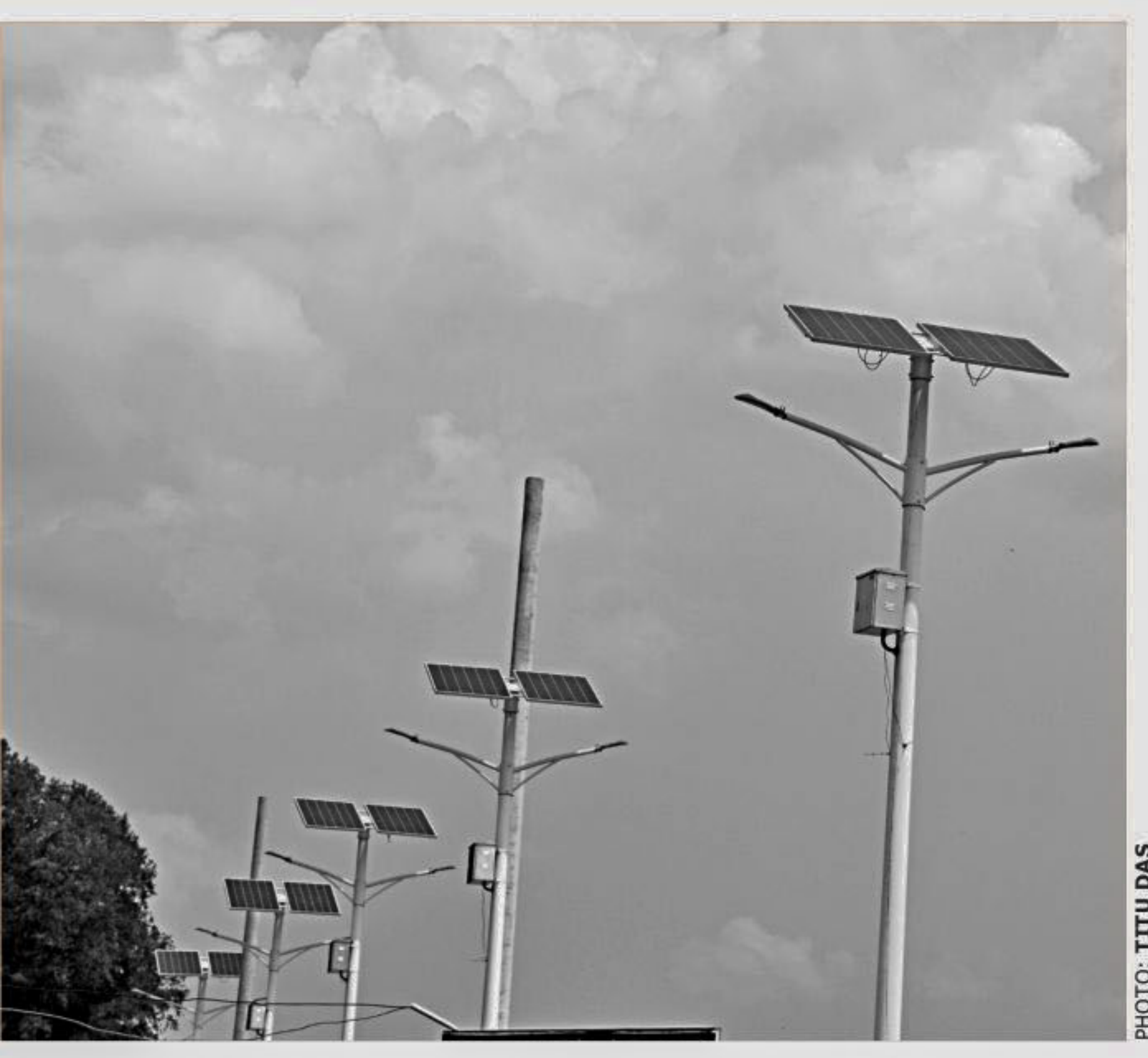
Solar panels installed on lamp posts in Barishal's 30 Godown area. The city corporation has set up the solar-powered lights to meet the power need and reduce dependency on non-green source of electricity. The photo was taken recently.