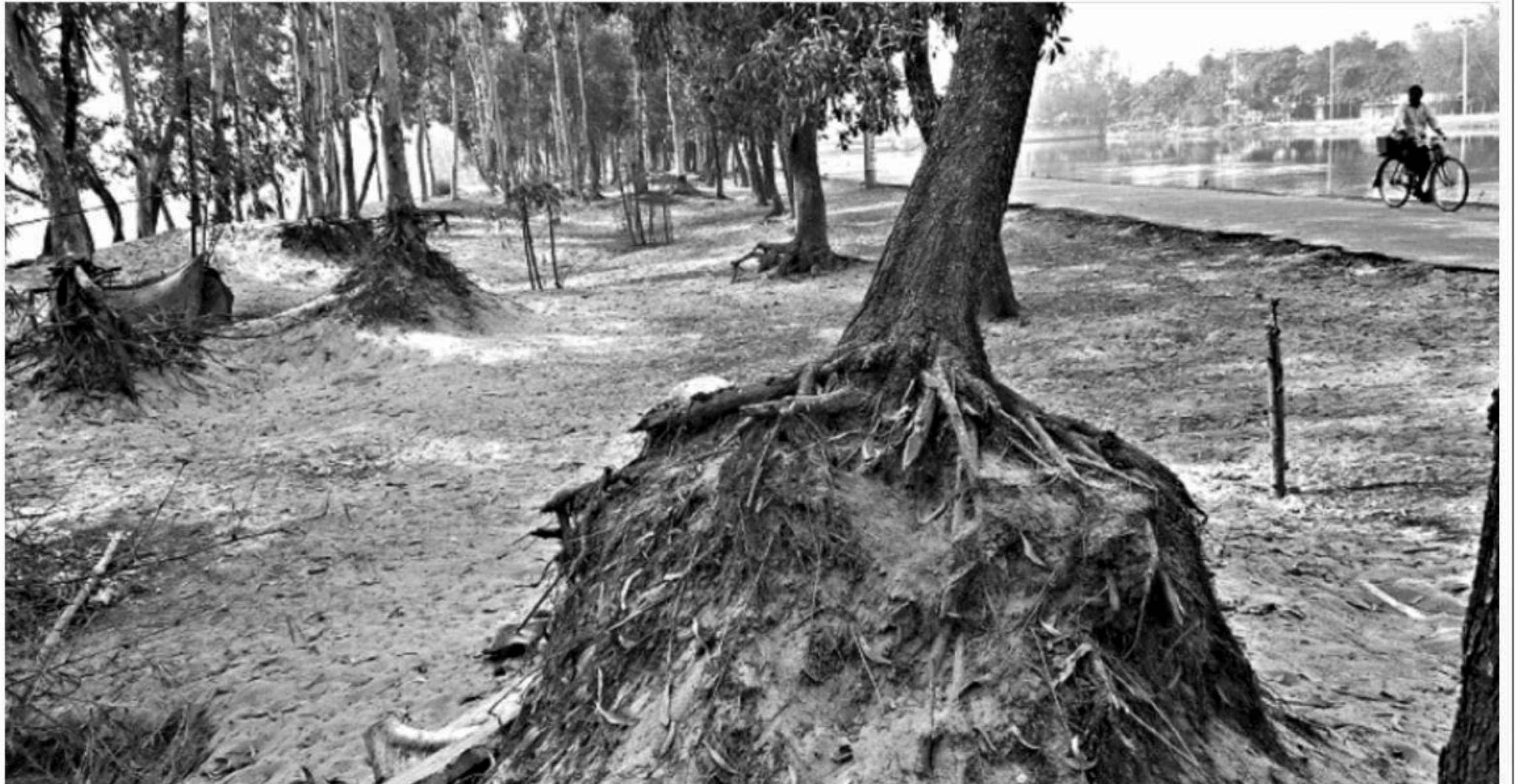
Roots of trees meant for strengthening the embankment on Teesta main irrigation canal lie exposed due to massive removal of earth from there, which leaves the embankment vulnerable to erosion and collapse.