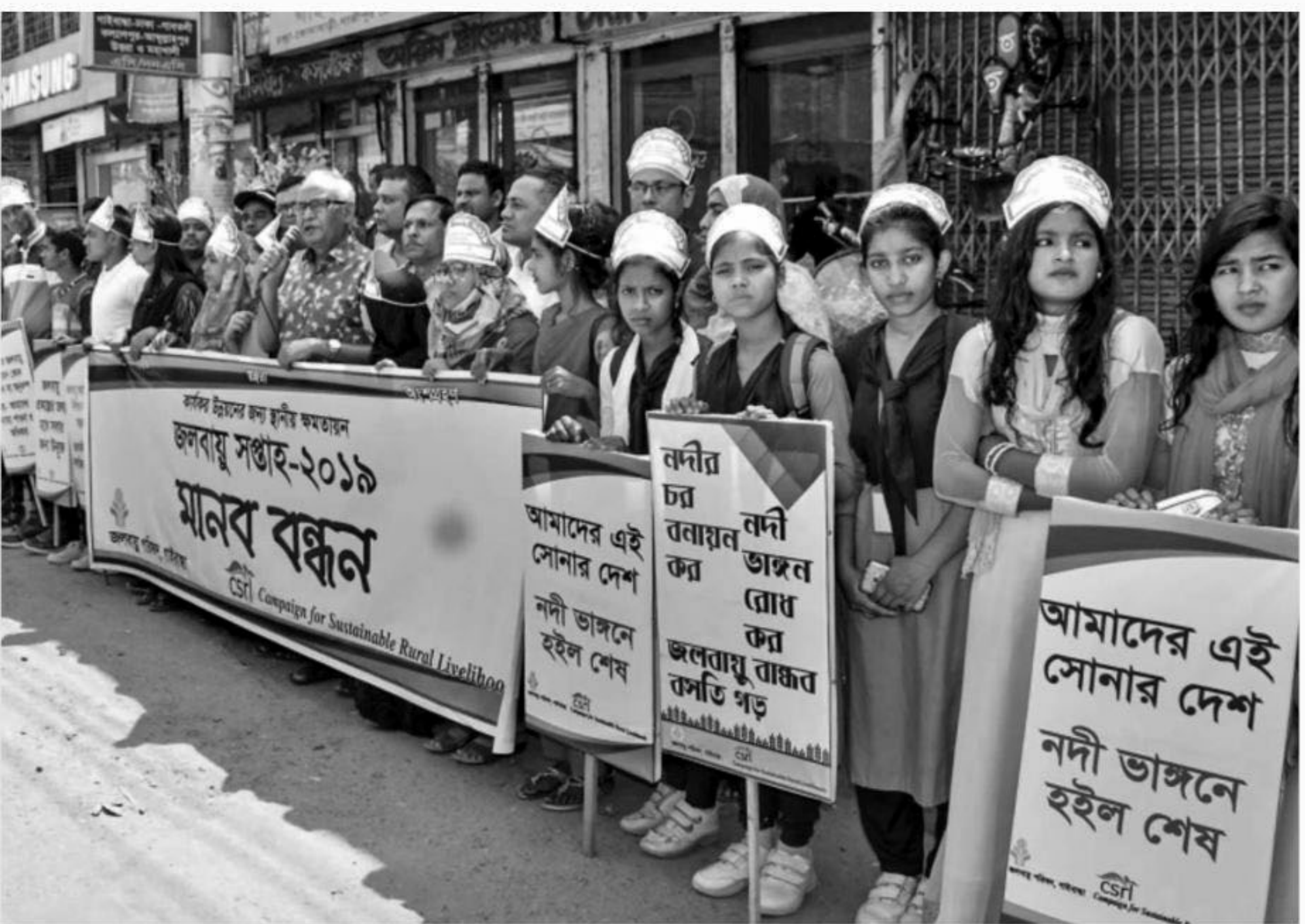
A cross-section of people join a human chain organised by Gaibandha chapter of Jalabayu Parishad on BD Road in the district town yesterday marking Climate Week 2019. Speakers at the programme urged empowerment of local bodies and allocation of sufficient budget for tackling the adverse effects of climate change.

OC Rashed Mobarak said they would take necessary action once Subed's involvement is found following completion of their investigation.