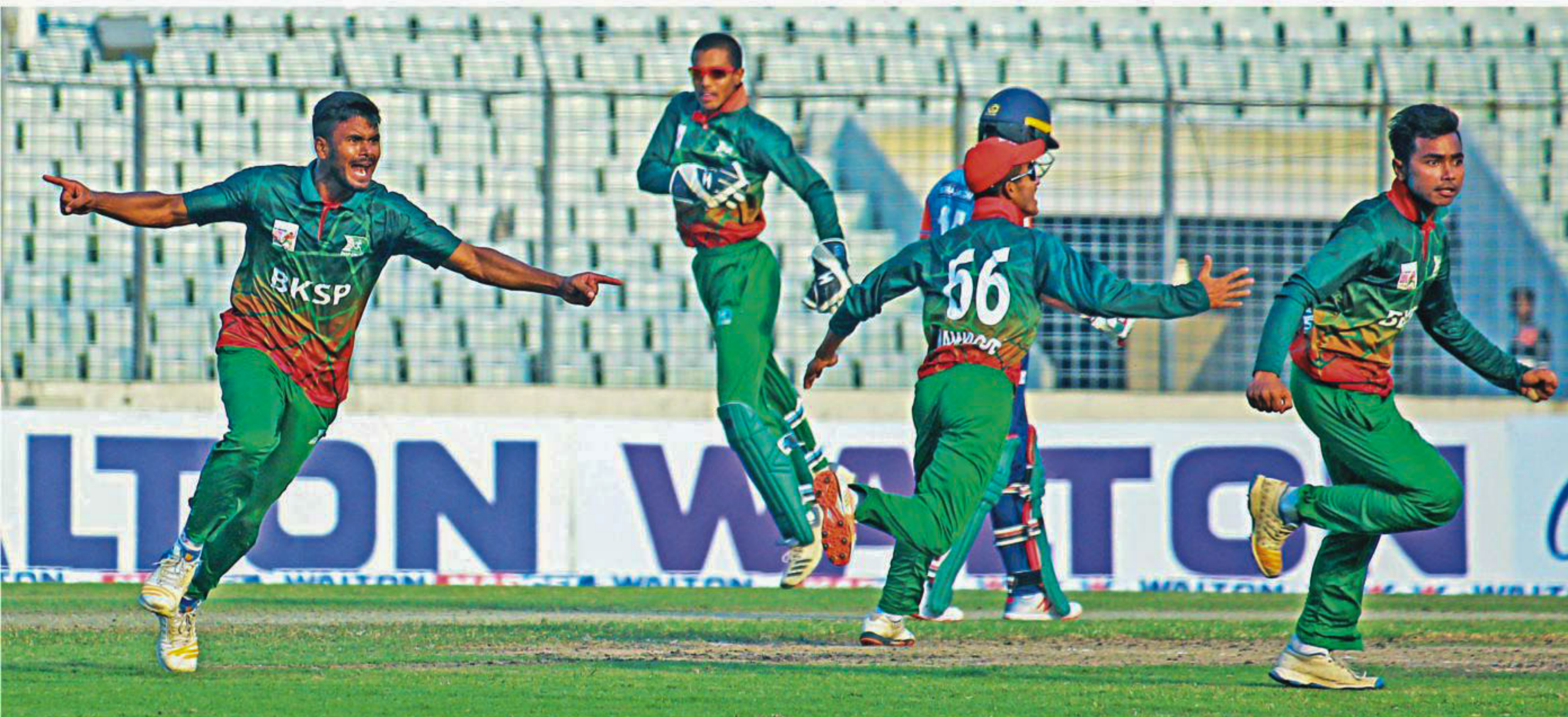
BKSP players celebrate gleefully after narrowly securing a two-run victory over Brothers Union in a Dhaka Premier League encounter at the Sher-e-Bangla National Stadium in Mirpur yesterday.