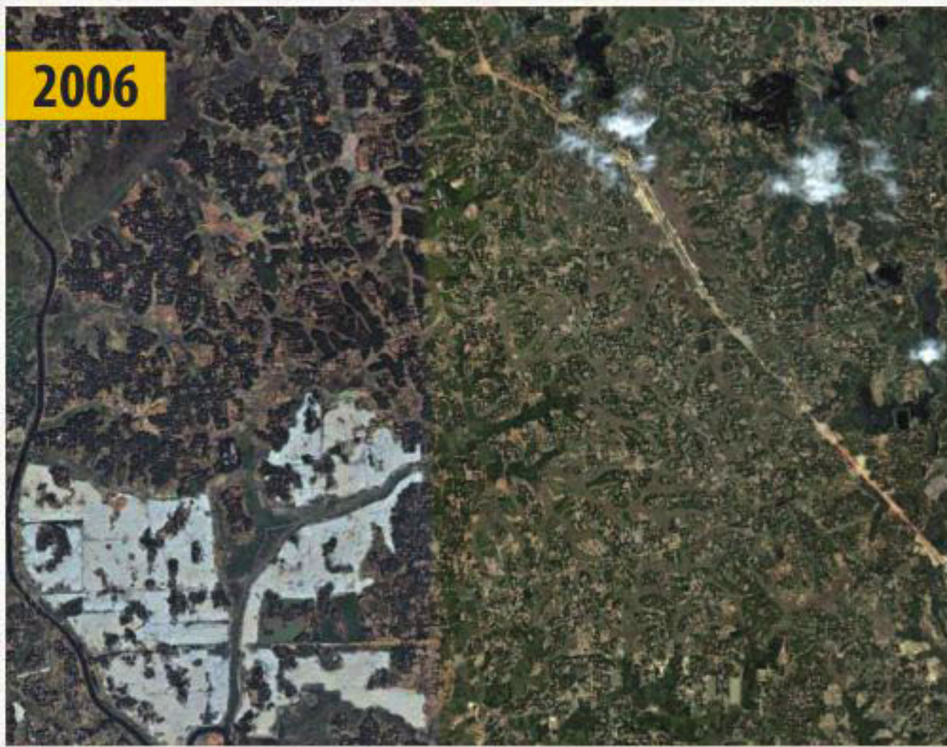
The images show how arable land and flood flow zones covering over 6,200 acres in Purbachal area on the outskirts of the capital have been turned into a housing project over the years.