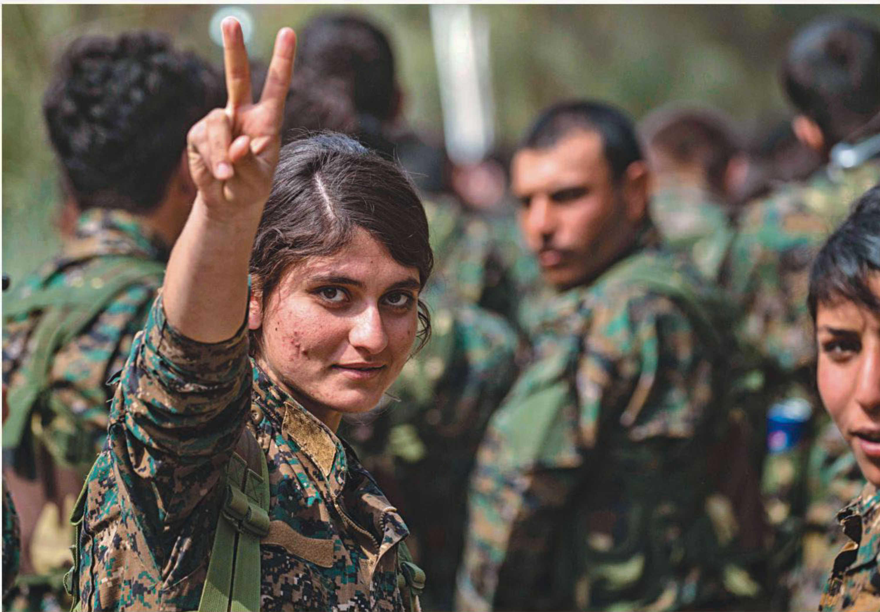
A female fighter of the US-backed Kurdish-led Syrian Democratic Forces flashes the victory gesture while celebrating near the Omar oil field in the eastern Syrian Deir Ezzor province yesterday, after announcing the total elimination of the Islamic State's last bastion in eastern Syria.