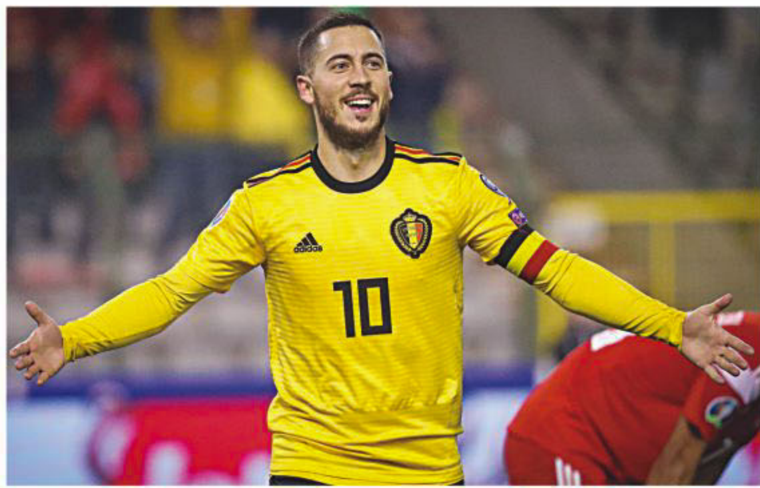
Belgium talisman Eden Hazard (L) led from the front during a Euro 2020 qualifying match against Russia on Thursday night, scoring twice in a 3-1 win at the King Baudouin Stadium in Brussels.

The Chelsea playmaker sealed the three points two minutes from time with an alert finish, while Aleksandr Golovin was sent off for Russia just before the end.