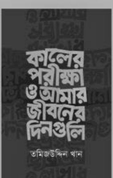
কালের পরীক্ষা ও আমার জীবনের দিনগুলি তমিজউদ্দিন খান