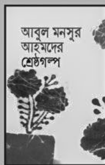
আবুল মনসুর আহমদের শ্রেষ্ঠগল্প