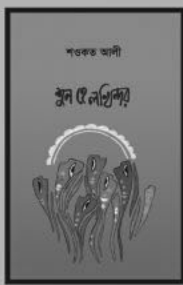
শুন হে লিখিদর শওকত আলী