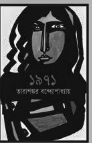
১৯৭১ তারানন্দর বন্দ্যোপাধ্যায়