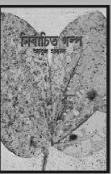
নিবাচিত গল্প আবুল হায়ত