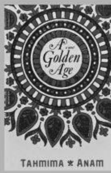
A GOLDEN AGE Tahmima Anam