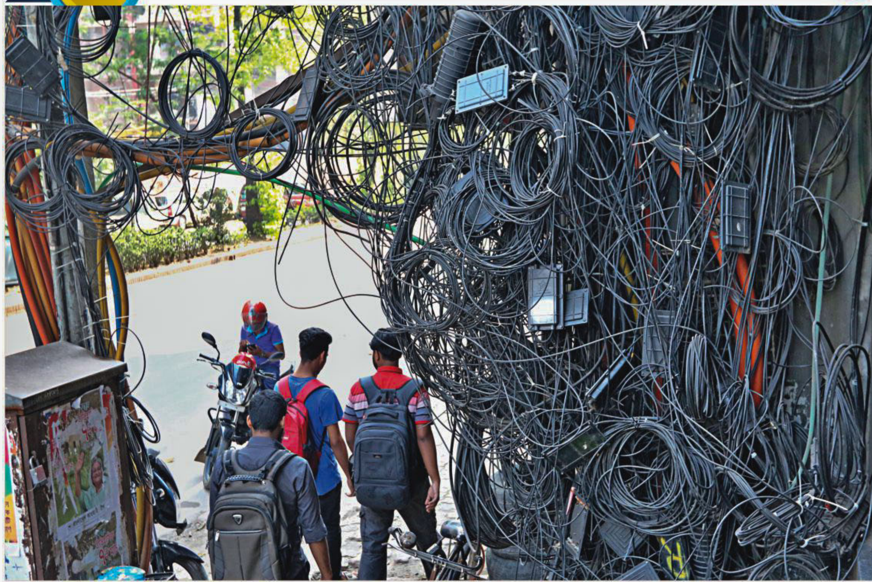
WHAT A TANGLED WEB WE WEAVE! Overhead cables are a common sight in the capital. These webs of wires not just pose serious danger, but also remain an eyesore. The photo was taken in Mohakhali area recently.