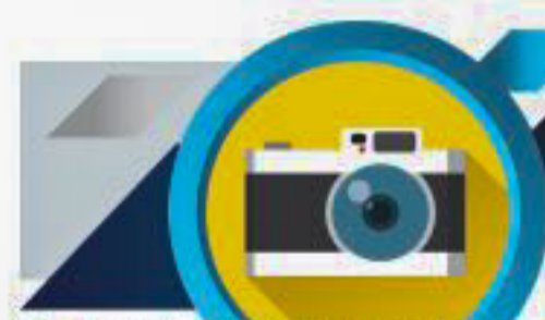
PHOTO OF THE DAY