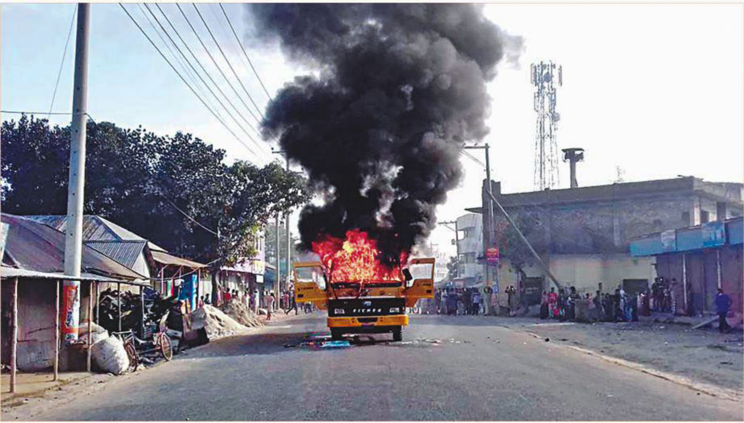
A truck in flames in Vodraghat area of Sirajganj yesterday. Angry locals set the vehicle on fire after it ran over and killed a college boy in the area.