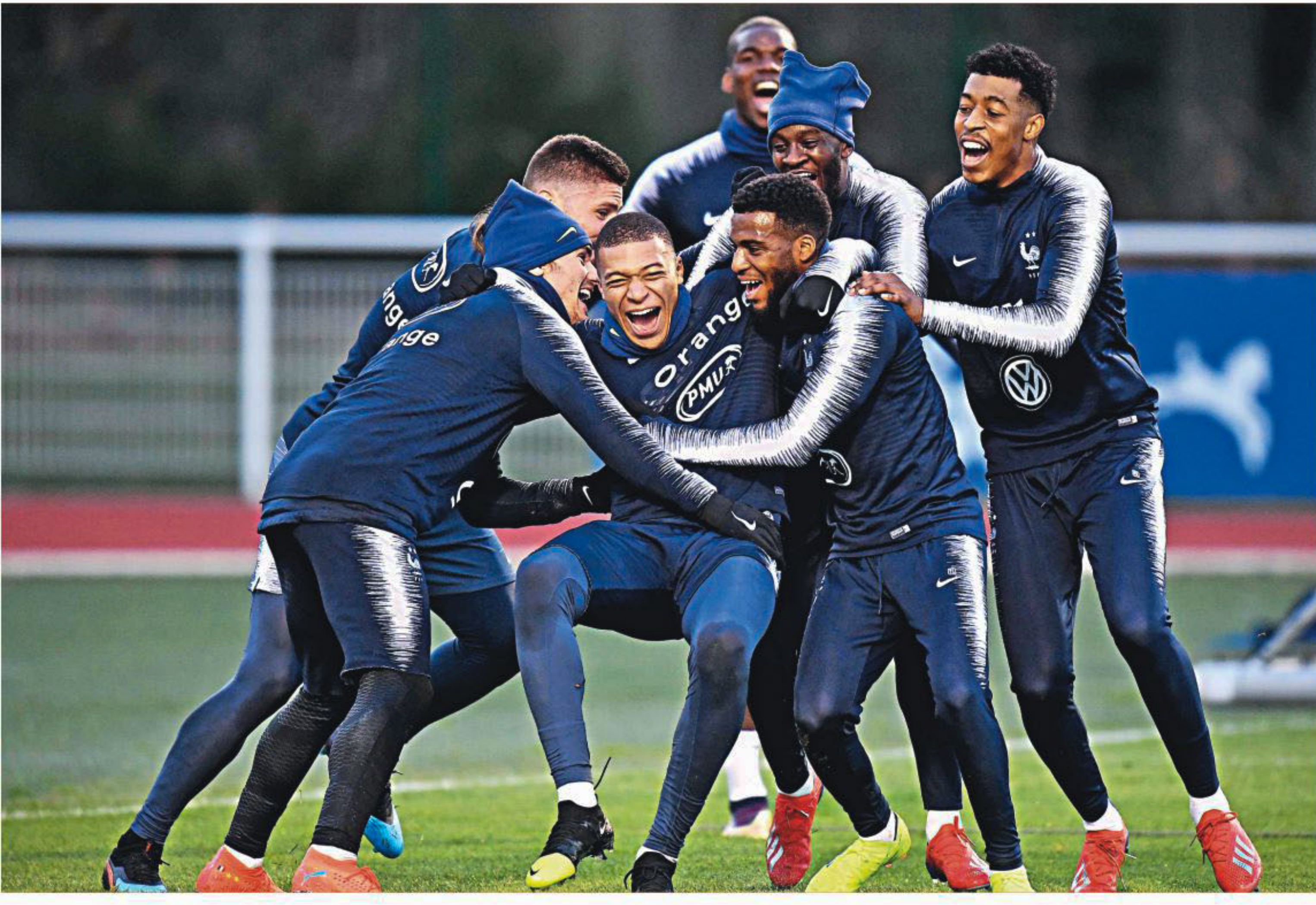
With French superstar Kylian Mbappe recently revealing that he keeps track of goals scored in training, his fun-loving national teammates swarmed the 19-year-old to celebrate one such goal in Clairefontaine yesterday.