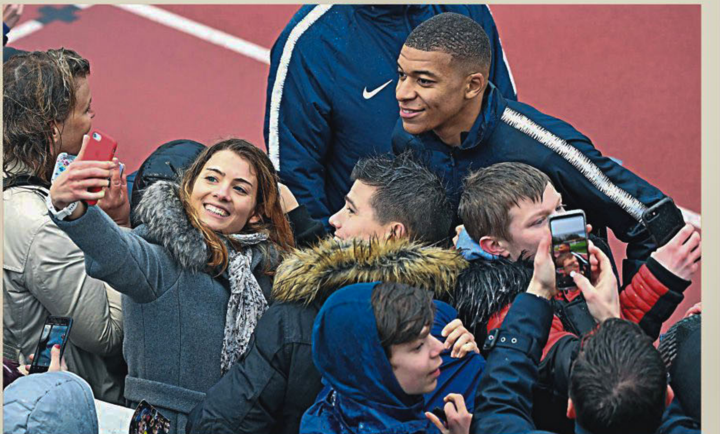
France star Kylian Mbappe (R) poses for selfies with fans before a training session in Clairefontaine on Monday as part of the team's preparation for the upcoming Euro 2020 qualifiers against Moldova and Iceland.

Napoli goalkeeper David Ospina has been discharged from hospital and is recovering from his frightening collapse after a knock to the head at the weekend, the Serie A club announced on Monday. The 30-year-old, who is on loan from Arsenal, will miss Colombia's international friendlies against Japan on March 22 and South Korea four days later after suddenly falling to the ground 41 minutes after receiving treatment following his collision with Ignacio Pussetto during Sunday's 4-2 win over Udinese. "David Ospina was discharged this afternoon from the Pineta Grande Clinic where he had been admitted last night for a series of checks," Napoli wrote in a statement. "Checks have ruled out any problem. The player was advised to take a few days of rest."