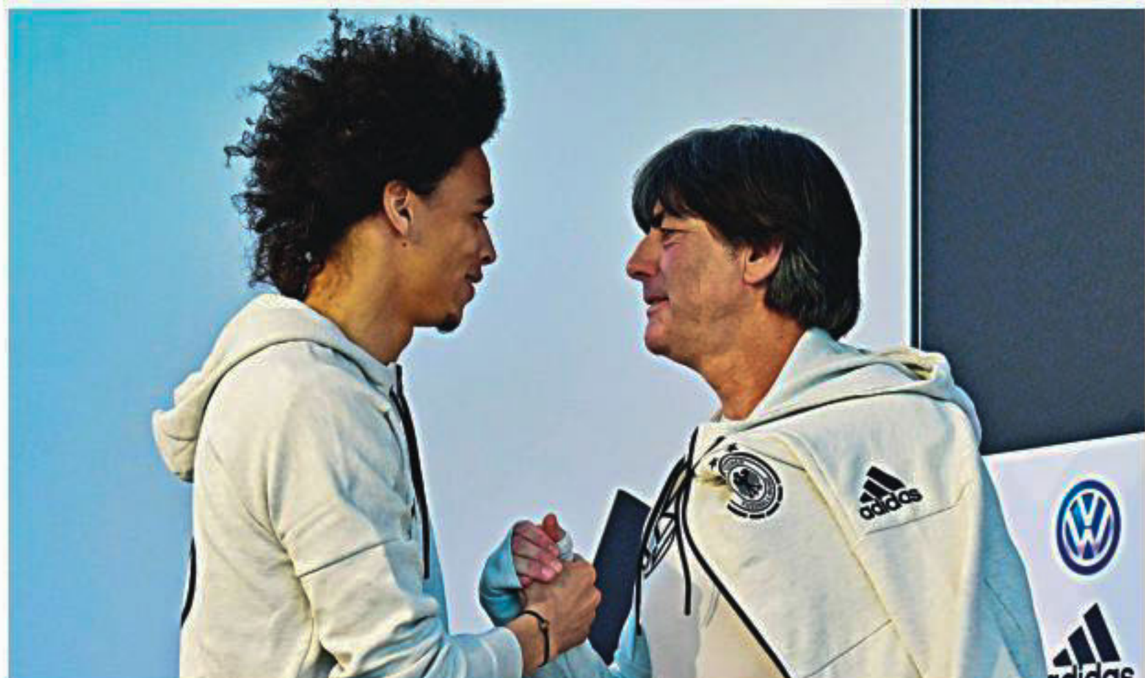
Germany winger Leroy Sane (L) shakes hands with coach Joachim Loew ahead of a press conference in Wolfsburg yesterday on the eve of their international friendly against Serbia.

as a gamble, which has heightened the pressure ahead of Wednesday's game. Yet the Germany boss has insisted that the right conclusions have been drawn from the failures of last year. "We have had a think since the World Cup," he admitted on Friday. "We need to be quicker, more ambitious and more dynamic. We lost all that at the World Cup and our game became quite predictable." Loew has given three young players their first international call-up.