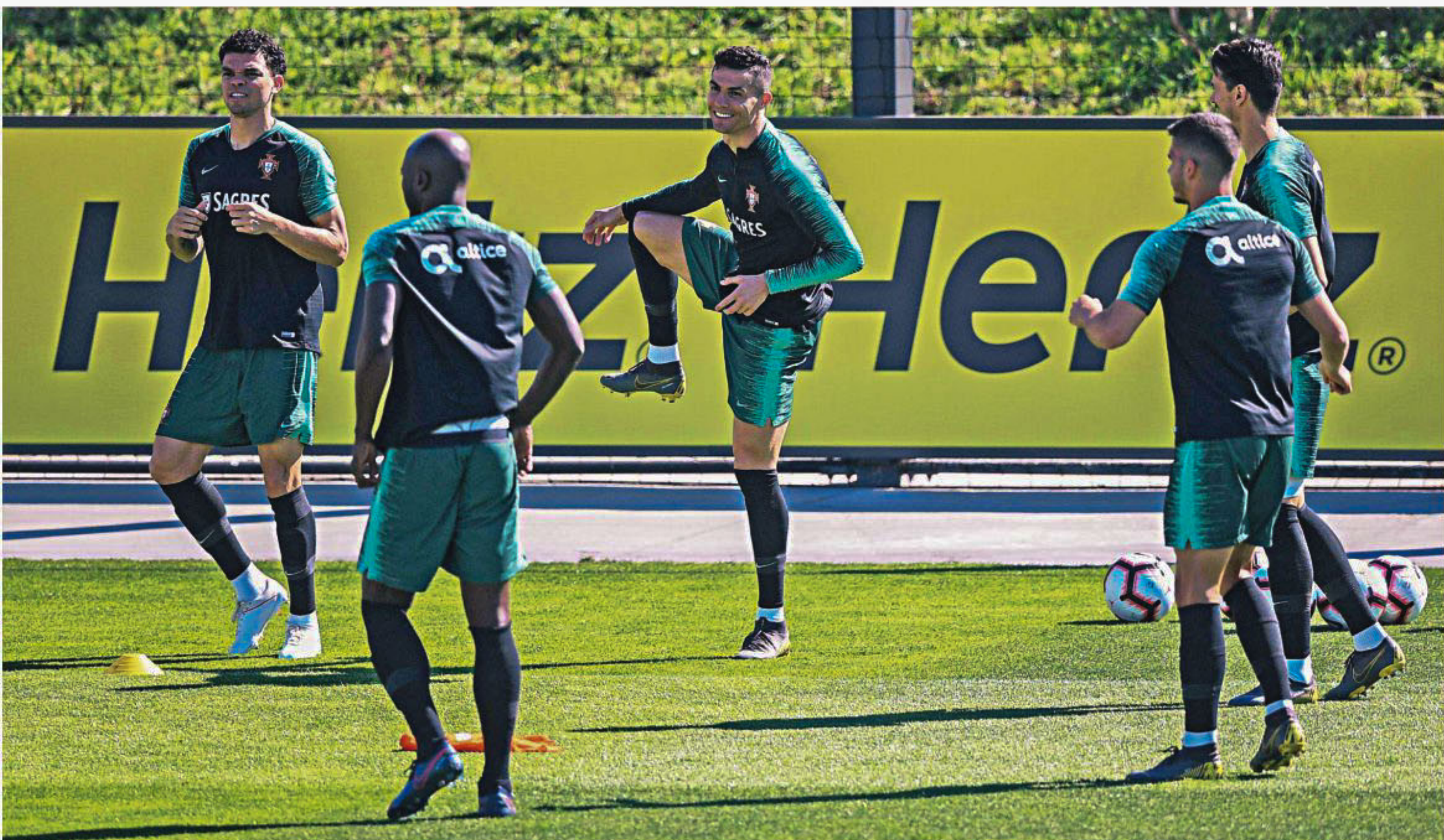
Portugal superstar Cristiano Ronaldo (C) warms up with his teammates during a training session at "City of Football" training camp in Oeiras yesterday ahead of their Saturday's Euro 2020 qualifier against Ukraine.

this way leaving a tournament. "I have been playing every single day for the last three weeks. I can be very happy and proud of that fact." As at Indian Wells, Federer could meet fellow Swiss Stan Wawrinka in the third round in Miami. Federer is a three-time winner at Miami, but he lost his second-round opener last year after falling to Juan Martin del Potro in the final at Indian Wells. With that in mind, Federer shied away from predicting he would bounce back in a big way from his loss to Thiem, with the Miami event's move to a new venue adding to his sense of uncertainty. "Now it's totally different," Federer said of the tournament moving from its long-time home on Key Biscayne to the Hard Rock Stadium -- home of the NFL's Miami Dolphins. A new stadium court inside the actual stadium is the centrepiece of the new venue, which also features a secondary grandstand court and two smaller show courts and practice courts. "Everybody's got to get used to centre court or the conditions at the new site," Federer said. "I'm eager to find out how it's going to be like. There are still a lot of open question marks. Right now I feel really good."