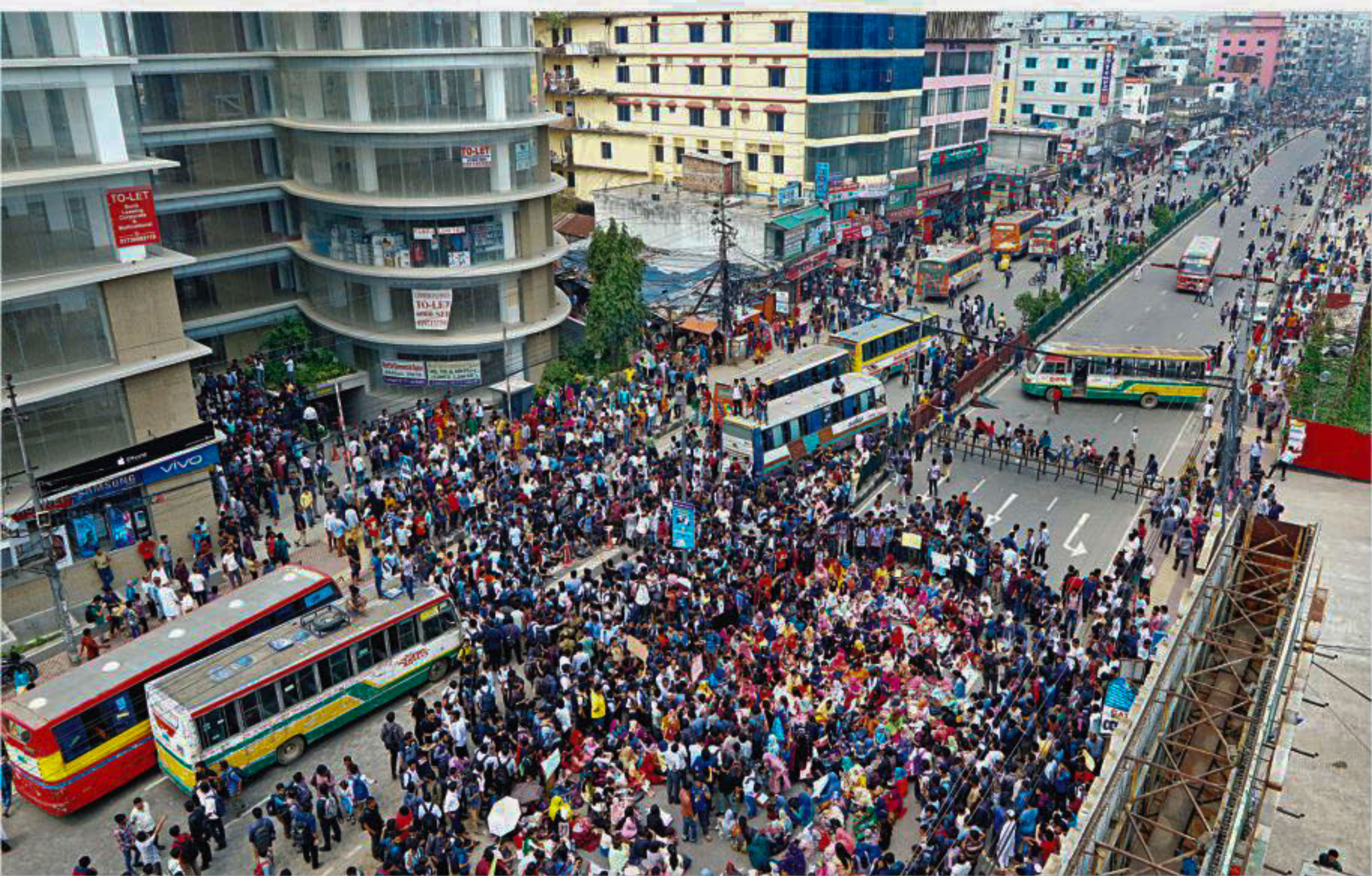
University students block Pragati Sarani in the city's Nodda yesterday morning, protesting the death of a fellow student in a road accident in the area.