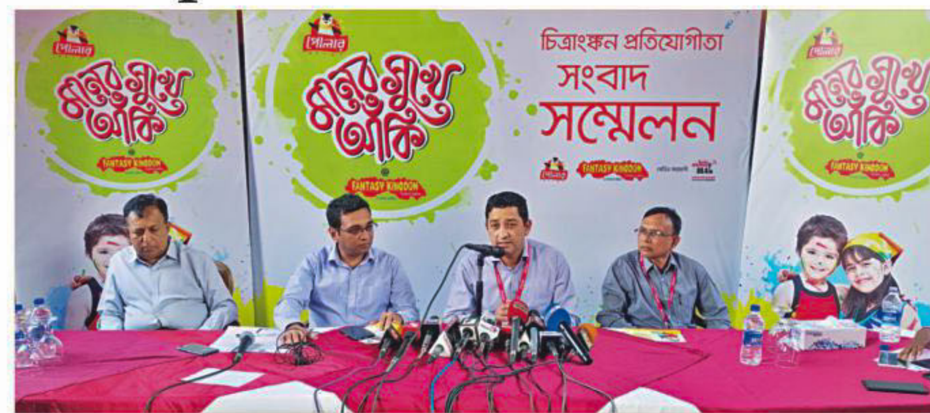
Organisers at the press conference.