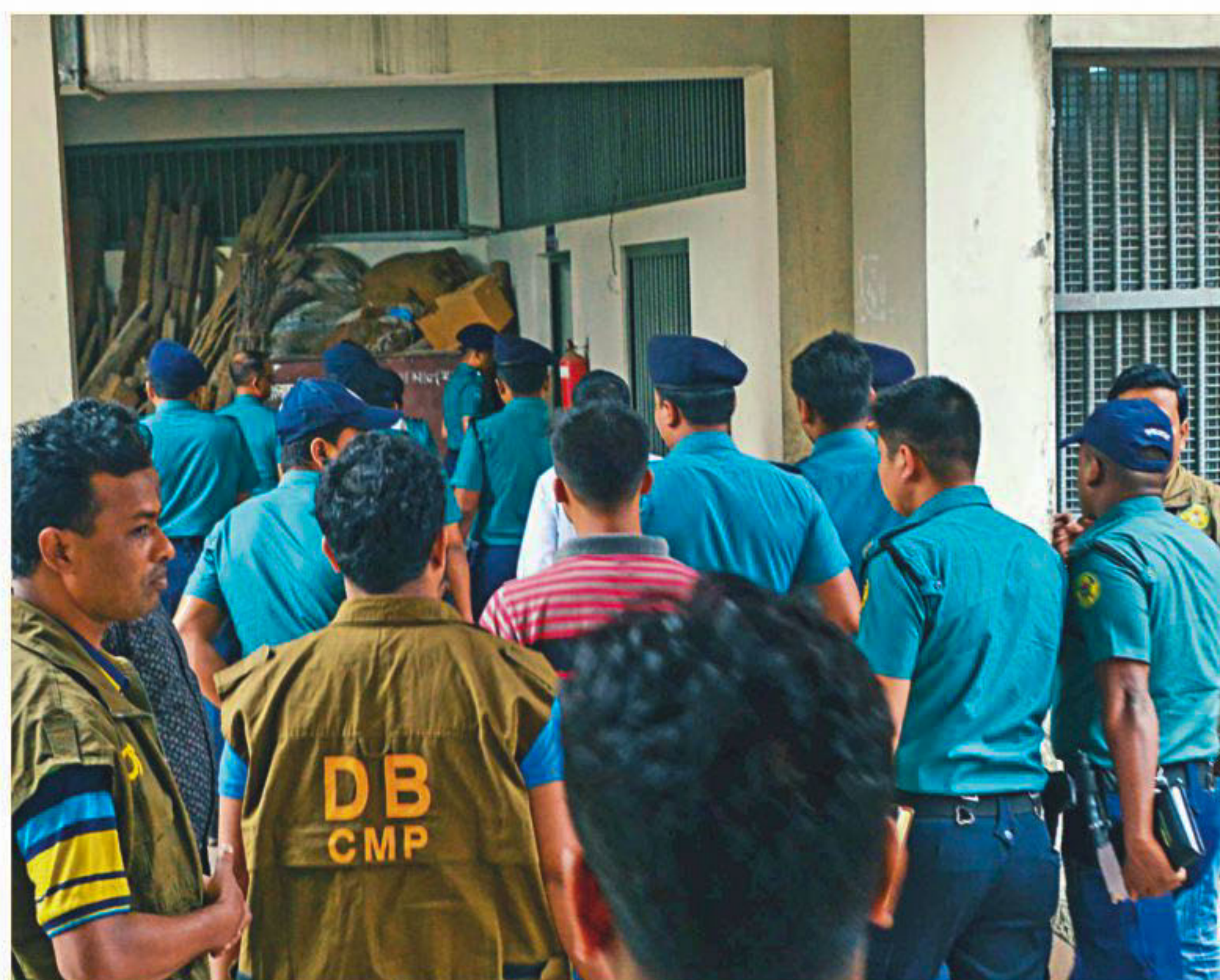
Police visit the crime scene in Chattogram Court's storeroom yesterday, where valuable evidence were stolen the previous night. They are now working on a list of missing items.