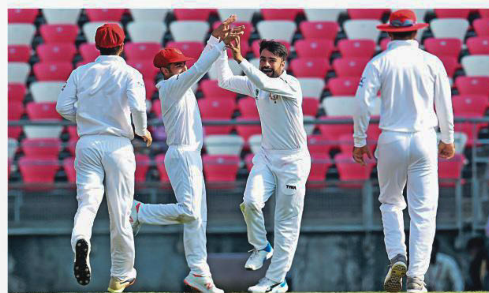
Afghanistan's leg-spin wizard Rashid Khan bagged a five-wicket haul that took the side within touching distance of their first Test win over fellow Test rookies Ireland on the third day of their one-off Test in Dehradun yesterday.

Afghanistan lost to India inside two days in Bangalore while Ireland went down to Pakistan in Dublin.