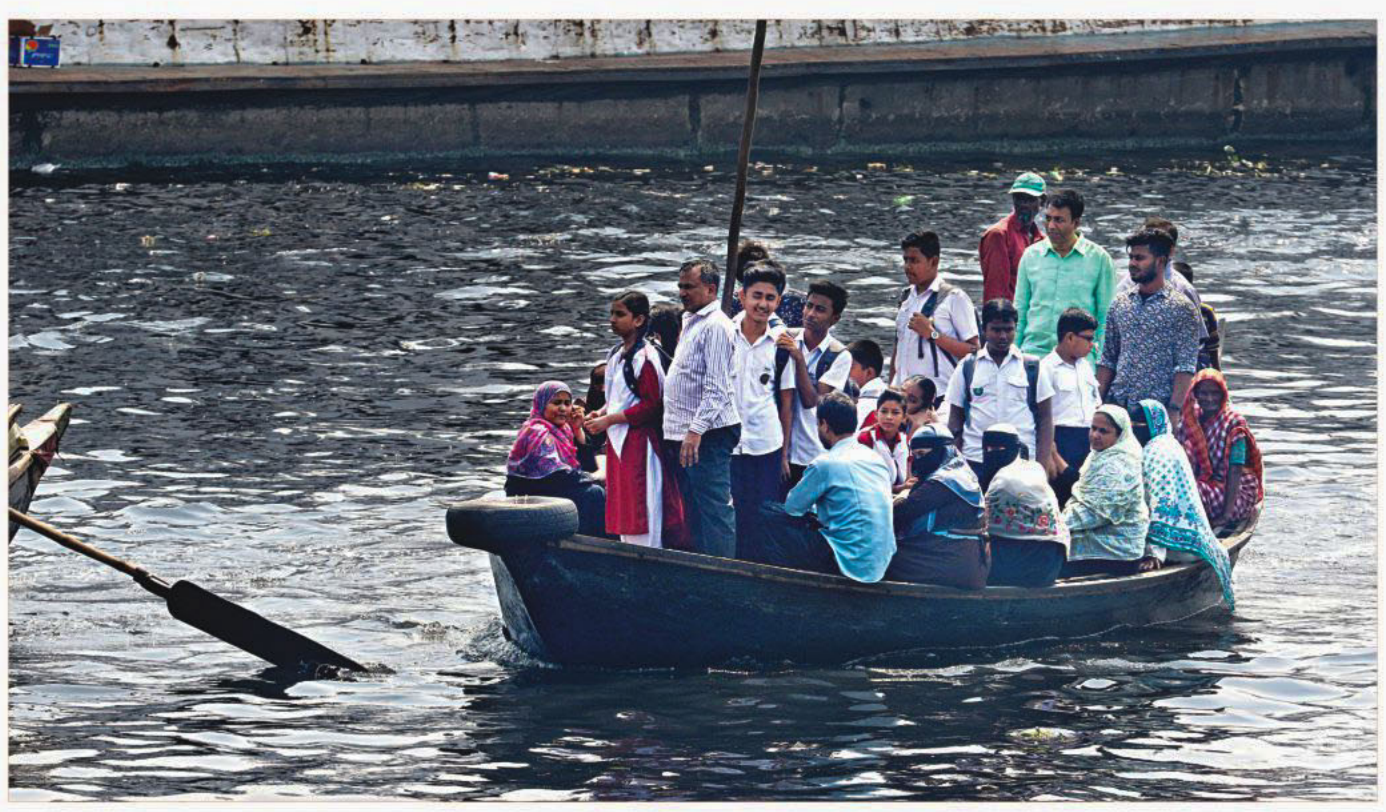
People crammed on a boat ferrying them across the Buriganga near Sadarghat in the capital yesterday. Many cross the river risking their lives this way. A little over a week ago, a boat sank in the river killing seven people.

TUHIN SHUBHRA ADHIKARY Drivers of CNG-run vehicles may have to show that the CNG-cylinders have been tested and certified before being allowed to refuel. Bangladesh Road Transport Authority (BRTA) has proposed making this mandatory since a large number of vehicles are on the road and their cylinders have not been retested in years. According to international guidelines and CNG rules 2005, the cylinders must undergo fitness tests every five years. But cylinders of only 91,771 out of 5,03,864 CNG-run vehicles have been tested, officials said. According to them, most of the rest have exceeded the five-year deadline to have their cylinders tested but are on the road. In a letter sent to the road transport and bridges ministry on March 7, the BRTA proposed making cylinder retest certificate a must at filling stations. It said a limited time could be given to owners to have their cylinders certified before the proposal is implemented. "We received some proposals from the BRTA on March 11 but no decision has yet been made," an official of the ministry told this correspondent yesterday. SEE PAGE 2 COL 4