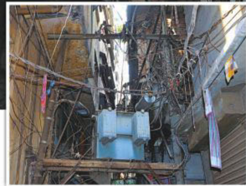
Electric transformers hang in precarious positions in the capital's West Islambagh area. Such installations can cause fatal accidents any time. The photos were taken yesterday.