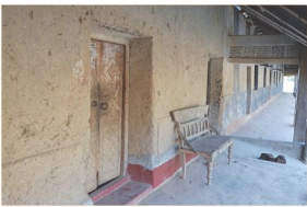
With 108 rooms, a mud house in Naogaon's Alipur village. Some well-off land owners built the two-storey abode in 1986.