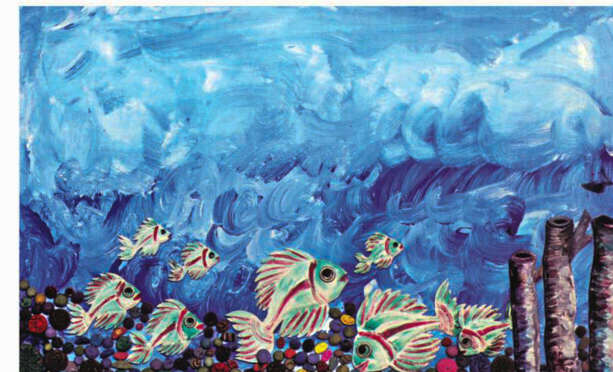
A PAINTING BY AKM MIZANUR RAHAMAN