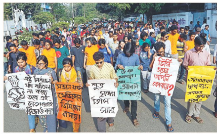
A procession of DU students demanding re-election to Dhaka University Central Students' Union yesterday.