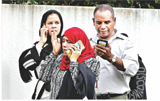
Witnesses report seeing people being shot after a "right-wing extremist" armed with semi-automatic weapons rampaged through two mosques in the quiet New Zealand city of Christchurch yesterday, killing 49 worshippers and wounding dozens more.

Al Noor Mosque 'Can't imagine something like this' Survivors recall horror of attack NEW ZEALAND HERALD ONLINE