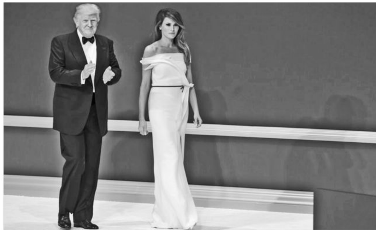
US President Donald Trump and First Lady Melania Trump during the Salute to Our Armed Services Inaugural Ball at the National Building Museum in Washington DC, January 20, 2017.

While criticising the president as a racist, a conman and a cheat, Cohen was very sweet in a chivalrous way in stating