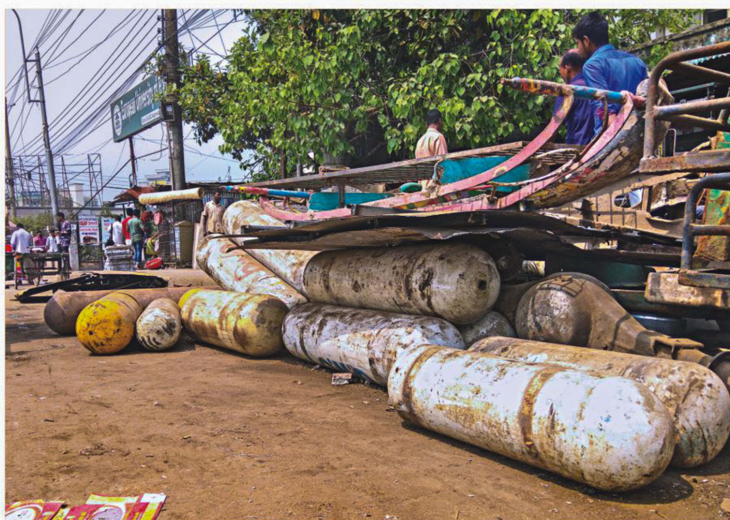
Date-expired, used gas cylinders have been kept on the roadside for resale. The photo was taken yesterday at Dhaka's Gabtoli area.