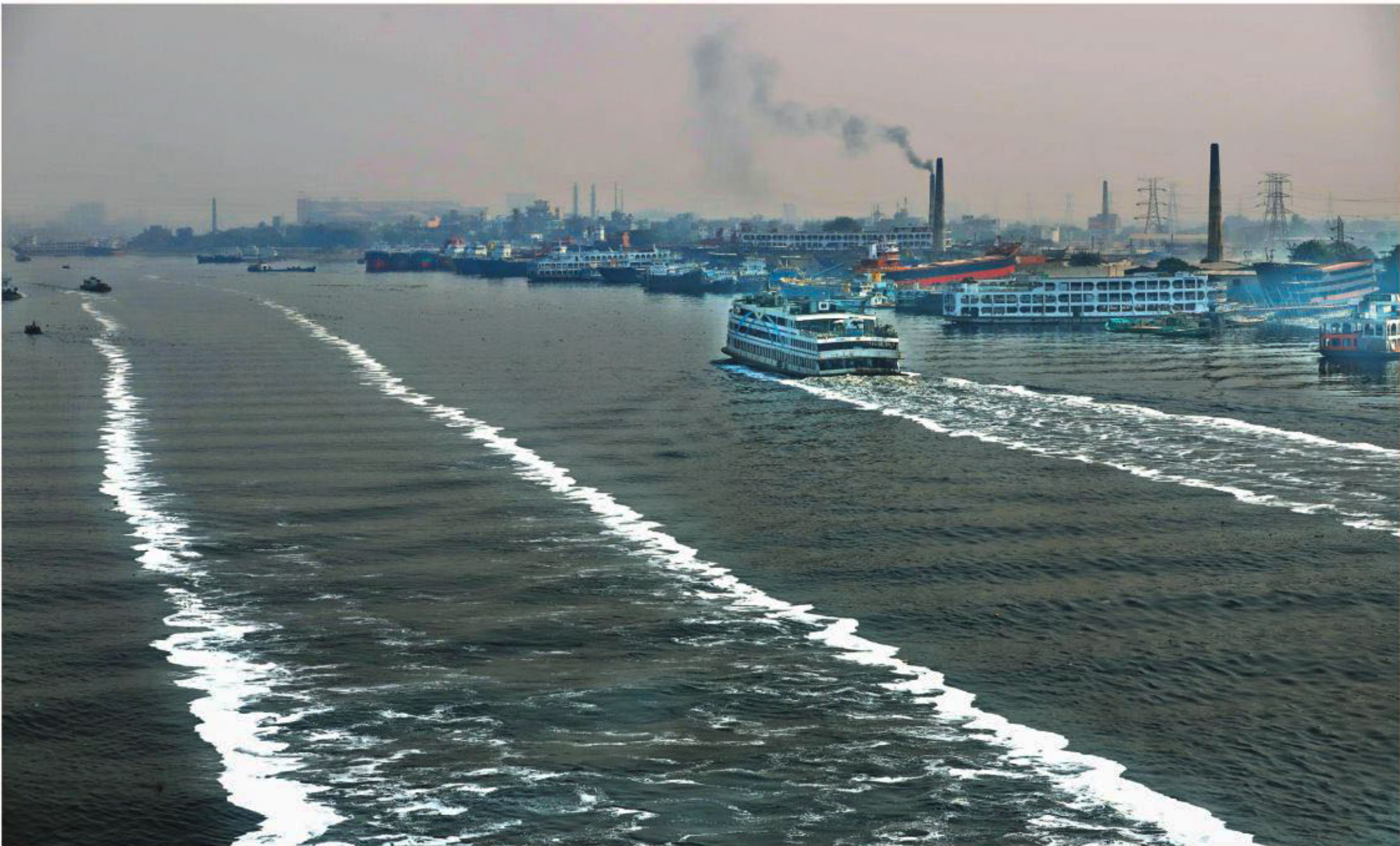
Tar-black water of Buriganga is a result of toxic waste released from factories on its banks for years. The stinky water is unfit for use even after treatment. The pollution is so acute that it affects aquatic species as well. The photo was taken recently, ahead of International Day of Action for Rivers observed yesterday.