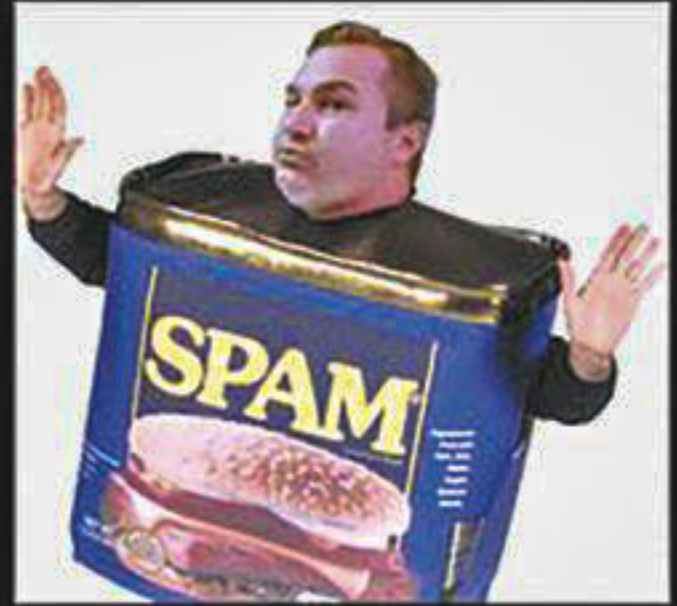
What Google Thinks I Do