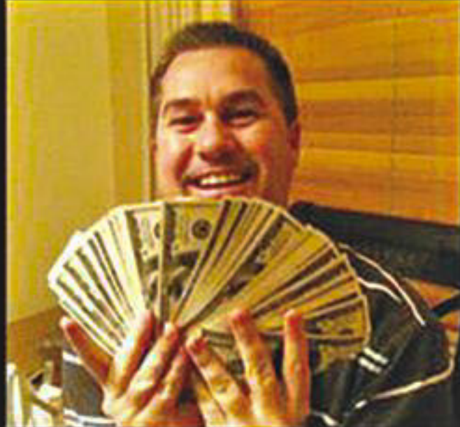
What My Boss Thinks I Do