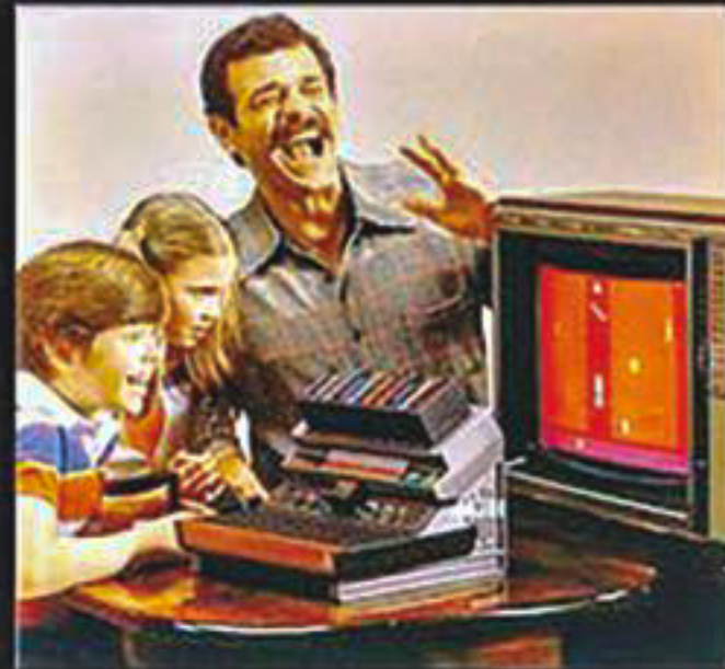
What My Parents Think I Do