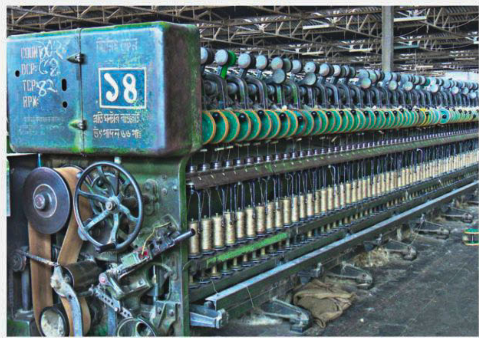
A jute factory remains deserted as workers go on a strike yesterday.