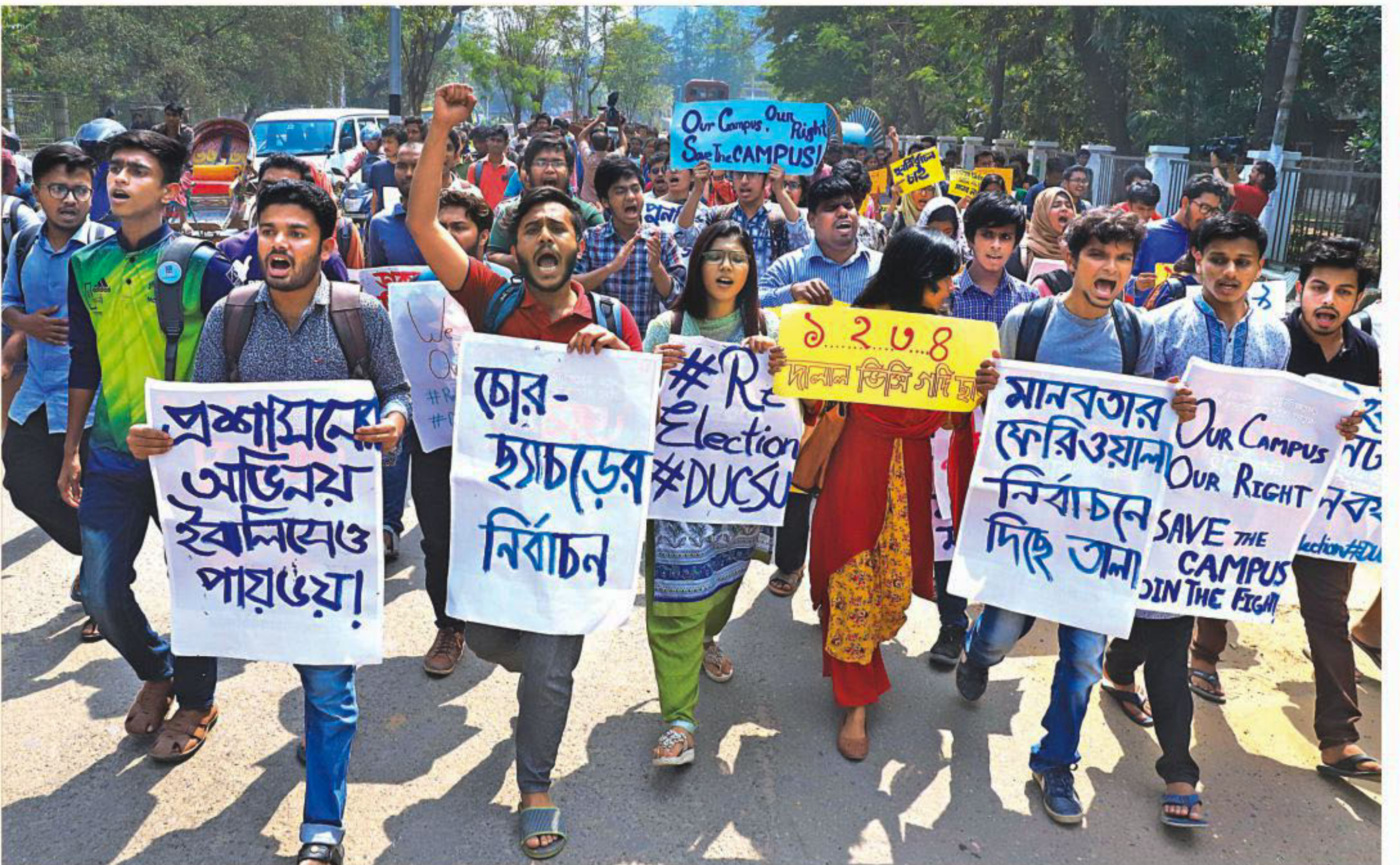
Yesterday morning saw demos and counter-demos at Dhaka University, a day after the long-awaited and much-debated Ducusu polls. Clockwise from top left, demanding reelection and vice chancellor's resignation, students bring out a procession. A student holds a placard reading "mystery of the [ballot] box". A locked classroom during students' strike. Rejecting election result, BCL activists stage a sit-in near the VC's residence. A man and a child on a bike move past a burning tyre, after agitators set it on fire.

Weather may remain dry with partly cloudy sky over the country, having chances of rain at one or two places over Sylhet division in the next 24 hours till 6pm today, UNB said quoting the Met office. The sun sets in the capital today at 6:07pm and rises tomorrow at 6:09am.