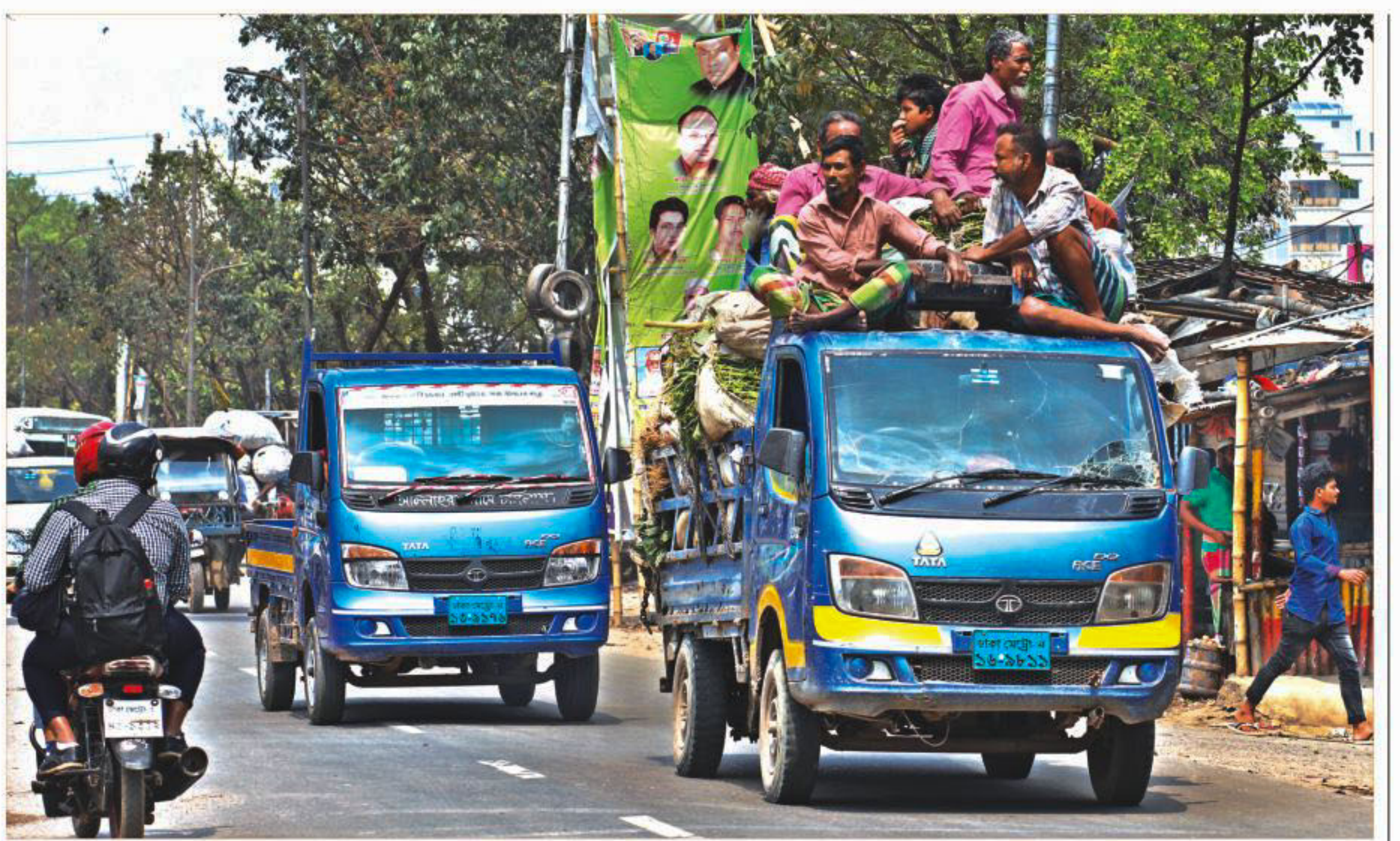
Vendors get on the roof of a speeding pickup truck loaded with vegetables on the capital's Hazaribagh Beribandh, putting themselves at risk of accident. The photo was taken yesterday.