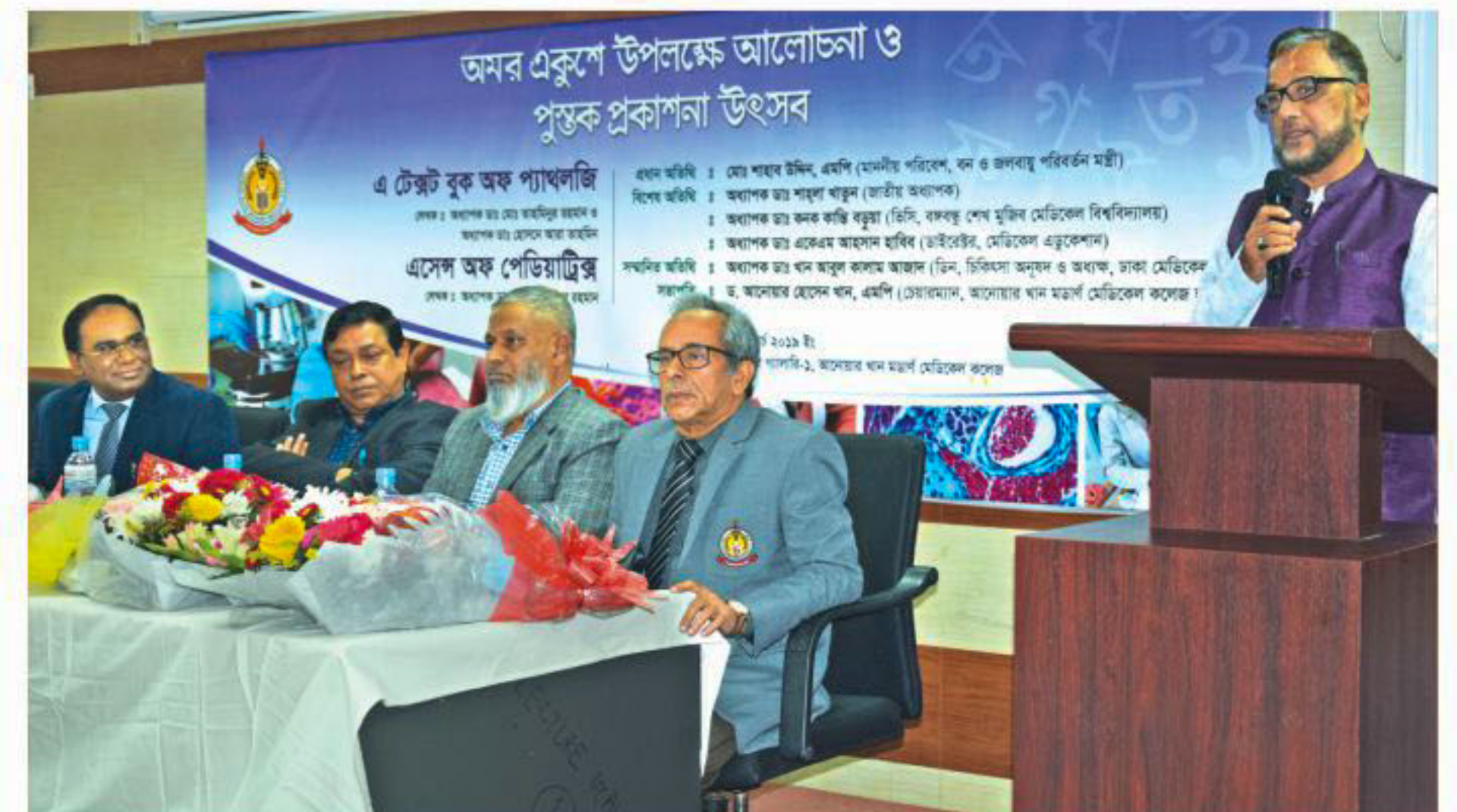
Environment, Forest and Climate Change Minister Md Shahab Uddin speaks at the publication ceremony in Dhaka on Sunday.