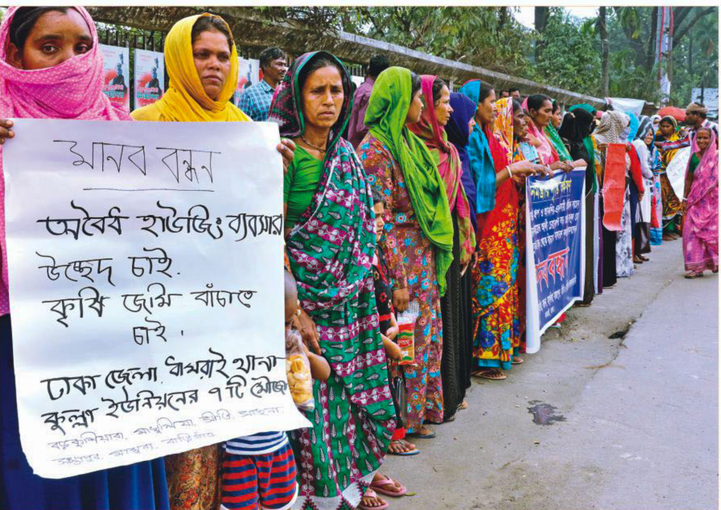
Residents from Kulla union of Dhaka's Dhamrai upazila form a human chain in front of Jatiya Press Club yesterday, demanding that arable land in the area be saved from illegal housing business.

Railway Nirapatta Bahini and police were present during the eviction drive.